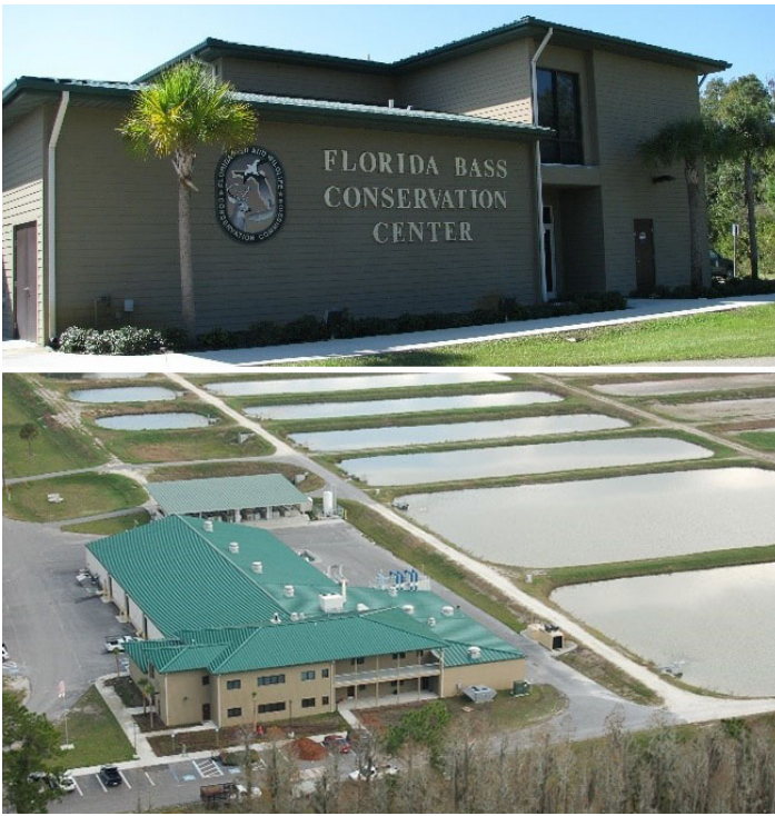
Figure 2. The Florida Bass Conservation Center, where nearly all of the fish for freshwater recreational stocking are raised.

goal is that this will increase angler catches and eventually lead to increased fishing trips and greater angler satisfaction with fishing and management. Maintaining stocking programs requires considerable agency resources, however, especially given the time and effort required to collect, maintain, and spawn brood stock, raise juvenile fish to appropriate sizes, and transport fish to waters for stocking. Since management agencies have limited hatchery space, personnel, and financial budgets, there is a limit to the number, size, and species of fish that can be stocked each year. Efficiently allocating agency resources requires good decision making about where and when to stock fish. The goal is to stock in a way that increases the overall stocking “success.”