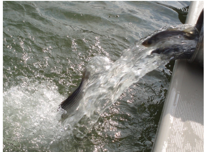
Figure 1. How “successful” will this hybrid striped bass stocking be?

Stocking, a common and popular but intensive option for managing and improving recreational fisheries, has a long history of use in Florida. To operate efficiently, fisheries management agencies must evaluate the success or failure of stocking programs. Researchers and management agencies have conducted years of research to better understand how stocking has affected freshwater fish and fisheries, but there is still no agreed-upon definition of successful stocking. This means that determining how “successful” stocking has been in Florida overall is challenging if not impossible. This document reviews recent scientific literature to describe the benefits of stocking and the potential drawbacks and thus to create useful definitions of stocking success. It also proposes some metrics for evaluating stocking success specifically tailored for Florida. We describe how successful stocking programs require explicit and measurable management objectives. For Florida's recreational fisheries, objectives may often focus on socioeconomic metrics, such as the number of active anglers, their satisfaction with the fishing experience, and their overall attitudes and perceptions of management, as well as biological measures like the survival or growth of the stocked fish themselves. We also describe how stocking, if well-planned, can achieve even broader research and management goals of increasing understanding of how fisheries function—both biologically and socioeconomically.