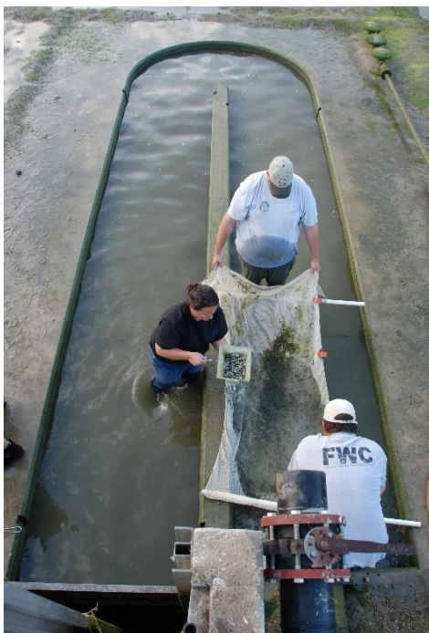
Figure 4. Workers at the Florida Bass Conservation Center collecting fish for stocking research.