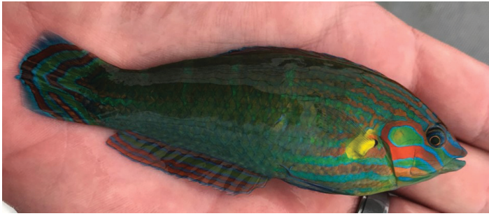
Figure 8. Tail-spot wrasse or melanurus wrasse ( Halichoeres melanurus ).

The second largest family of marine ornamental fishes is the wrasses (Thresher 1984). Wrasses are exclusively marine, often inhabiting shallow tropical and subtropical coral reef ecosystems in the Atlantic, Pacific, and Indian Oceans, with very few species found in temperate waters such as the ballan wrasse ( Labrus bergylta ) (Thresher 1984).