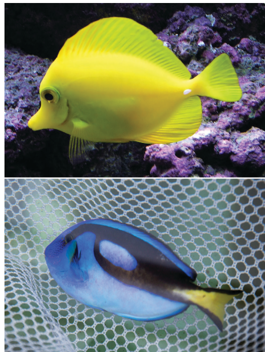
Figure 7. Yellow tang ( Zebrasoma flavescens , top), and palette surgeonfish or blue tang ( Paracanthurus hepatus , bottom).

Tangs are pelagic spawners with altricial larvae that require small first-feed items such as copepod nauplii (DiMaggio et al. 2017). Initiation of metamorphosis has been recorded to occur as early as 50 DPH (DiMaggio et al. 2017). It is important to note that members of this family are highly sensitive and prone to disease. Optimal water quality, nutrition, and general husbandry are critical in maintaining healthy and productive broodstock.