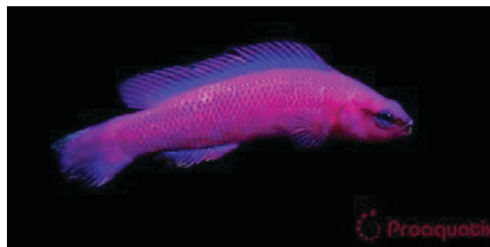
Figure 2. Orchid dottyback ( Pseudochromis fridmani ).