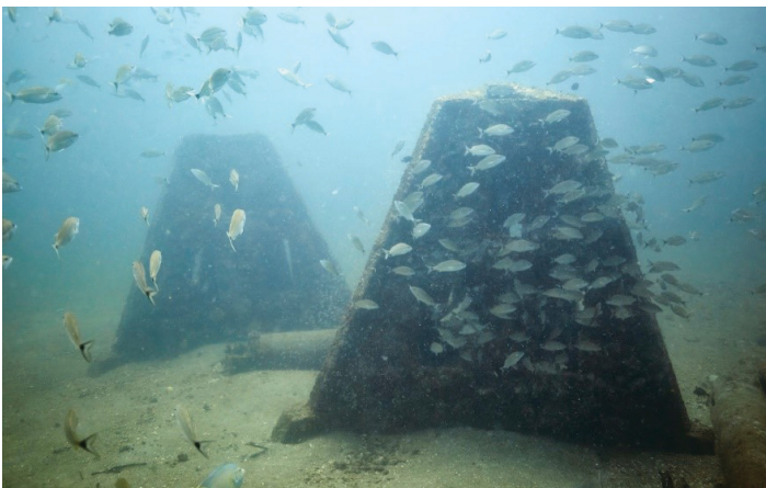
Figure 2. While “high-profile” reefs like steel vessels, planes, army tanks, etc. do exist, the majority of artificial reefs implemented in Florida are lower-profile items.

There is a need for additional research that evaluates how well artificial reefs perform as habitat for fish and other marine organisms. One area that needs more research is artificial reef material and design. We need to know how different materials are “viewed” differently by fish and result in different ecological and economic outcomes. While more unique and iconic projects (such as large shipwrecks, artistic sculptures or underwater memorials) may attract more attention, the majority of artificial reefs implemented in Florida are more similar to the local natural habitat and are made of smaller, lower-profile materials like concrete and rocks (Figure 2).