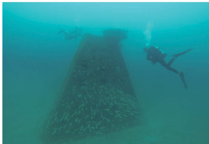
Figure 1. Artificial reefs are popular with fish and people.

direct impacts. It is important to remember that these are only general categories and that often people play multiple roles.