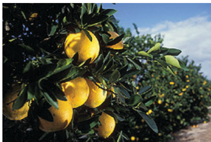
Figure 3. USDA

Table 1 shows the costs of production by program. The estimates include both the cost of materials and the cost