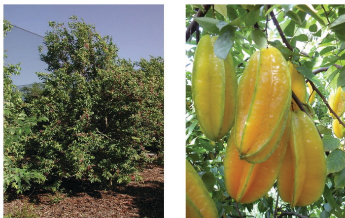
Figure 1. 'Arkin' carambola tree in flower and 'Kary' carambola fruit.

The initial carambola introductions into Florida were about 100 years ago and were tart in flavor (Crane 2016). Florida's commercial carambola production is estimated at 150 acres and constitutes 90 percent of the carambola grown in the United States (Crane 2018). Sixty-seven percent of the total carambola acreage is in Lee County and about 27% in Miami-Dade County, with the rest of the production in Palm Beach and Broward Counties.