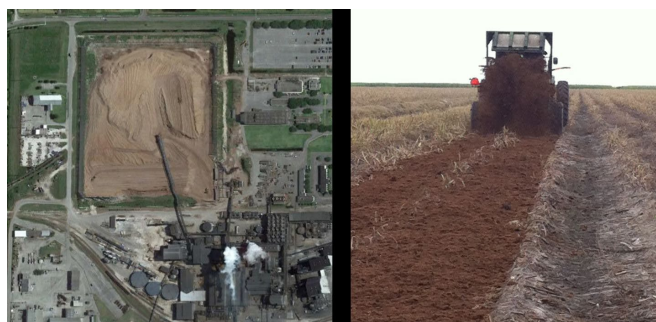
Figure 2. Left: Pile of bagasse being generated at the U.S. Sugar processing plant in Clewiston, FL. Right: Application of bagasse on mineral soils where sugarcane is grown.

Approximately 18 million tons (mt) of sugarcane were produced in Florida in 2020 (USDA NASS 2021), which corresponds to nearly 2.8 million mt of bagasse by-product (Bhadha et al. 2020). There exists an opportunity for utilizing the material as a soil amendment when applied on mineral soils, possibly offsetting some of the cost of inorganic fertilizer inputs (Figure 2). Typically, south Florida's mineral soils are low in nutrient content due to their low soil organic matter content and nutrient retention capacity as shown in Table 1. Bhadha et al. (2020) have previously summarized the potential benefits of utilizing bagasse as a soil amendment in sugarcane production in south Florida (EDIS #SL477). Bagasse can alter the soil physiochemical properties, enhance soil quality, and increase crop yield (Xu et al. 2021). Its low bulk density (0.06 oz/in 3 ) and low pH ( 4.0 \pm 0.1 ) can be beneficial when applied to mineral soils with high pH. Bagasse has high organic matter (95%) and high water-holding capacity (>50%) (Xu et al. 2021). Bagasse also has a high nutrient content that could be beneficial for plant growth (Table 2) and is a food source for soil biota. Previous studies have reported an increase in microbial biomass and communities in the soil where bagasse mulch was applied (Miura et al. 2013; Silvia 2014).