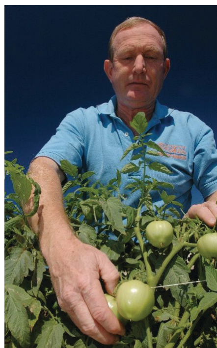
Figure 1. UF/IFAS Extension agent inspecting growing tomato vines.

The H-2A Temporary Agricultural Workers Program is one solution that provides an opportunity for producers navigating the labor crisis within Florida and other US states. The purpose of this publication is to review the agricultural labor crisis in Florida and to analyze how the H-2A program addresses the related concerns. This publication is intended to address the questions and concerns of stakeholders, including producers, consumers, labor activists, and government officials and entities.