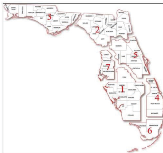
Figure 1. Map of the FDOT districts.

by District 6 ($36.2 million), the Florida Turnpike (FTE) District ($28.6 million), and District 7 ($24.7 million). For the study period, expenditures peaked in 2009 and 2013 at $43.9 million and $43.4 million, respectively. Expenditures were deflated to express as constant 2011 dollars using the GDP Implicit Price Deflator (United States Department of Commerce, Bureau of Economic Analysis).