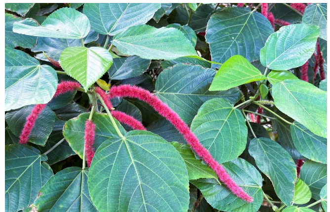
Figure 3. Flower— Acalypha hispida : chenille plant.