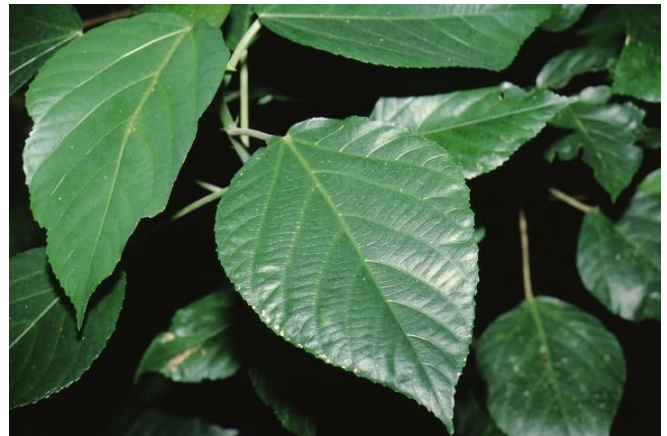
Figure 2. Leaf— Acalypha hispida : chenille plant. Credit: UF/IFAS

Chenille plant is a vigorous, upright, coarse-textured shrub with a height of 4 to 6 feet (Figure 1). Older specimens can grow taller with some support. The stems are heavily foliated with 6- to 8-inch-long ovate medium-green leaves (Figure 2). The showy red flowers of chenille plant are attractive and droop in cattail-like, narrow pendent clusters up to 18 inches in length (Figure 3). Chenille plant flowers year-round, with peak flowering season during the summer. This plant is dioecious—only the female plant produces the notable flowers; however, the plants grown and available in the horticultural trade are all female.