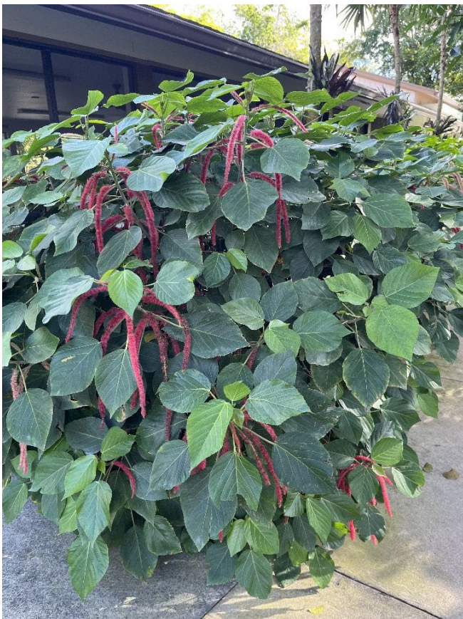
Figure 1. Full Form— Acalypha hispida : chenille plant.