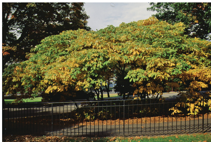
Figure 2. Full form, fall color— Aesculus parviflora : bottlebrush buckeye.