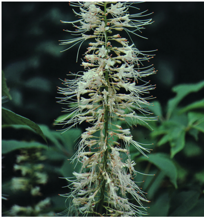
Figure 4. Flower— Aesculus parviflora : bottlebrush buckeye.