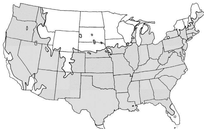
Figure 5. Shaded area represents potential planting range.

Availability: somewhat available, may have to go out of the region to find the plant