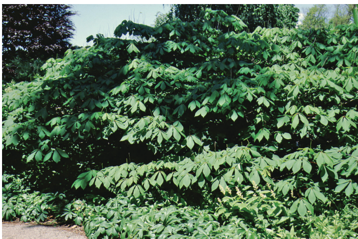
Figure 1. Full form— Aesculus parviflora : bottlebrush buckeye.

Native from Alabama and South Carolina into Florida, bottlebrush buckeye forms a rounded mass of dark green, palmately compound foliage in mid-spring (Figure 1). The shrub eventually reaches about 8 feet tall but grows to 12 feet wide. It can be found in its native, moist, shaded habitat flowering in early summer. The delicate, showy, white flowers are held well above the foliage in terminal panicles up to 12 inches long. Bottlebrush buckeye has been successfully used as far north as Chicago (hardiness zone 5).