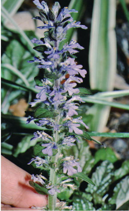
Figure 3. Flower— Ajuga reptans : common bugle, bugleweed, carpet bugleweed.

Origin: native to Africa, temperate Asia, and Europe Invasive potential: invasive and not recommended by UF/IFAS faculty (reassess in 10 years) Uses: mass planting; container or above-ground planter; ground cover; edging Availability: somewhat available, may have to go out of the region to find the plant