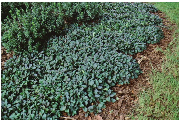
Figure 1. Full form— Ajuga reptans : common bugle, bugleweed, carpet bugleweed.

This ground-hugging groundcover produces a profusion of dark green to bronze- or purple-colored leaves in a flat rosette, spreading fairly quickly by runners or stolons. Plant on 6- to 12-inch centers for quick establishment of a thick ground cover. Six-inch-tall spikes of small blue flowers are produced in spring to early summer and are especially attractive when plants are massed together. There are selections with foliage variegated in green, white, red, yellow, and pink.