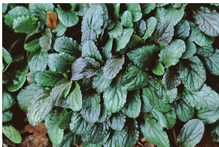
Figure 2. Leaf— Ajuga reptans : common bugle, bugleweed, carpet bugleweed.