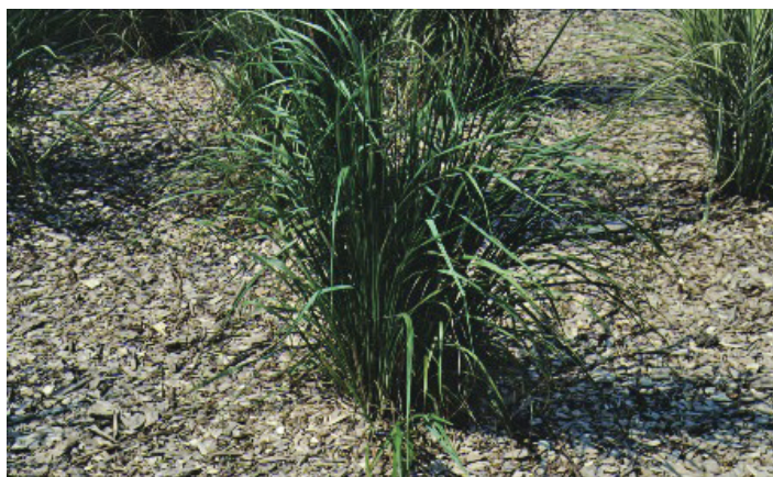
Figure 1. Full Form - Calamagrostis arundinacea : Reed Grass.

Reed grass is an ornamental grass that attains a height of 5 to 7 feet. The medium green leaves of this plant are lanceolate in shape and may reach a length of 5 to 7 feet. They also exhibit good fall and winter color. The inflorescence of this plant is a compact, spike like panicle that is 4 to 8 inches long. These inflorescences are loosely branched and have a pinkish white or reddish cast. They appear in the summer and are followed by attractive seed heads that are used in flower arrangements. This plant spreads by rhizomes which allows it to slowly increase in diameter.