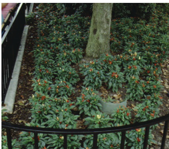
Figure 1. Full Form— Capsicum annuum : Ornamental Pepper

Ornamental peppers reach 10 to 20 inches in height and are grown as annuals or pot plants, producing colorful fruits from May until frost. In warmer climates, ornamental peppers are perennial and one of the best bedding plants for hot weather conditions, performing beautifully as a ground cover in mixed flower borders, as an edging, or in containers. Even though they can be perennial in USDA hardiness zones 9b, 10, and 11, plants are usually changed out at the end of the season. Fruits are available in a wide range of colors, from red, purple, yellow, orange, or white. Several colors are often seen at the same time on plants as the fruits ripen and change color. While the peppers are said to be edible, most palates will find them much too hot.