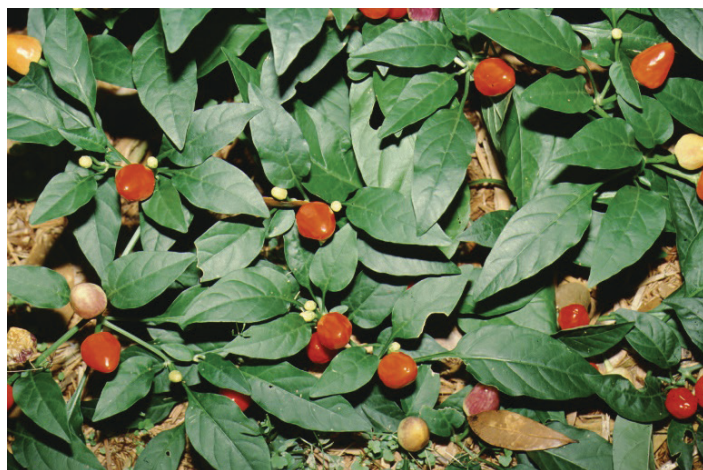
Figure 2. Leaf— Capsicum annuum : Ornamental Pepper