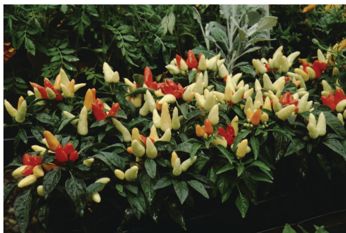
Figure 3. Fruit— Capsicum annuum : Ornamental Pepper