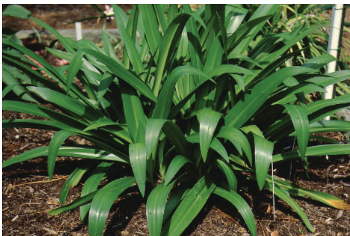
Figure 1. Full Form - Crinum americanum : String Lily, Swamp Lily, Seven Sisters

The swamp lily is a herbaceous perennial native to the southeastern U.S. that rises from a 3 to 4½ inch thick, fleshy bulb. The linear, leathery leaves grow in a rosette. These glossy leaves are bright green and reach a length of 1 to 4 feet. White or pink-striped flowers sit atop a succulent, cylindrical flower stalk that is 1 to 3 feet tall. A 6inchlong floral tube bears six petals and sepals, and rosy stamens that are tipped with yellow emerge from the throat of this tube. These striking, fragrant flowers appear in the spring, summer and fall seasons of the year. The fruits of the swamp lily are lobed seed capsules that are 1 ½ to 2 inches thick.