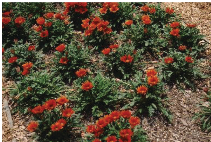
Figure 1. Full Form— Gazania x 'Bronze Red' : Bronze red gazania.

Gazania is a perennial grown as an annual that grows well in rock gardens or in other hot, dry areas. It forms a very low, ground-hugging ground cover, producing bright yellow, orange, or red, daisy-like flowers. Flowers close at night and on very cloudy days. Plants grow 6 to 12 inches tall with blueish foliage. Do not plant in the partial shade. Full day sun is required for healthy plants.