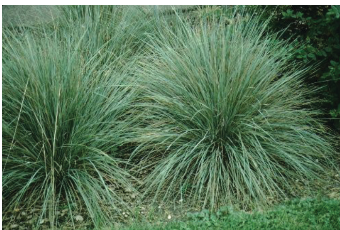
Figure 1. Full Form— Helictrotrichon sempervirens : Blue oat grass.

Also known as Avena sempervirens , blue oat grass is a perennial, ornamental grass that has attractive thin gray-green, or blue leaves. Leaf blades grow to about 12 inches long and are 0.5 inch wide and taper to a fine point. Plants grow 18 to 30 inches tall. The glaucous foliage provides a welcomed contrast to a green border. Beige terminal panicles are produced in June through August, maturing to a light brown by the fall when they break apart and fall from the plant. Attractive, light brown fall foliage color persists throughout the winter.