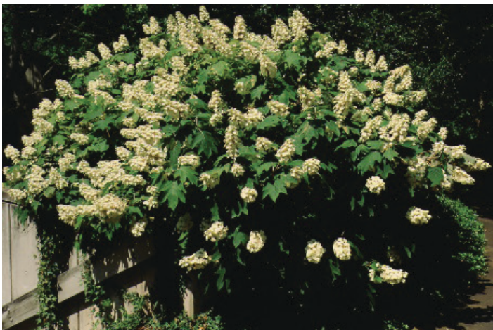
Figure 1. Full Form - Hydrangea quercifolia : Oakleaf Hydrangea