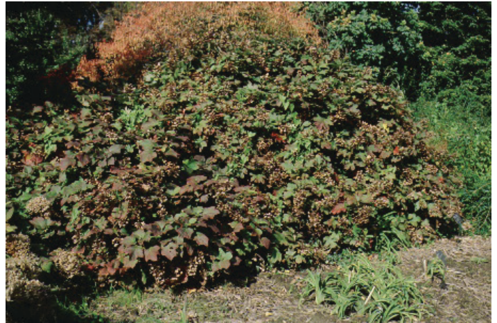
Figure 2. Full Form, Fall Color - Hydrangea quercifolia : Oakleaf Hydrangea

Oakleaf hydrangea has 8 to 12 inch long leaves shaped like oak leaves. They are borne on stiff, upright, hairy stems which occasionally branch. A fuller shrub can be created by pinching the new growth or cutting back old growth. The plant grows in sun or shade and prefers a rich, moist soil. In the northern part of its range, the top usually dies back during the winter, and it needs shelter from high winds. Oakleaf hydrangea transplants easily and has a very coarse texture and good red fall color. This sprawling, slow-growing shrub reaches 6 to 10 feet tall and spreads three to five feet. The flowers, produced in mid-summer in panicles, are at first white, then fade to pink and then tan. If you wish to prune this hydrangea to create a dense shrub, do so after it flowers so you can enjoy the spectacular flower display.