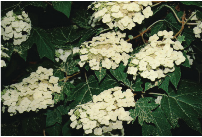
Figure 4. Flower - Hydrangea quercifolia : Oakleaf Hydrangea