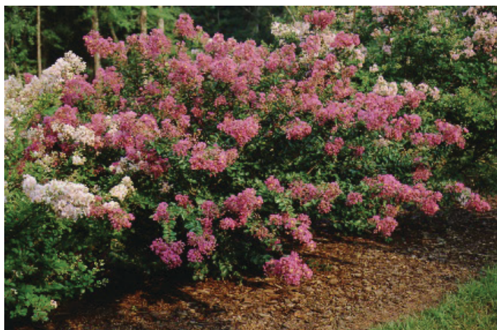
Figure 1. Full Form - Lagerstroemia indica 'New Orleans': New Orleans Crape Myrtle

A long period of striking summer flower color, attractive fall foliage, and good drought-tolerance all combine to make crape myrtle a favorite small tree for either formal or informal landscapes. It is highly recommended for planting in urban and suburban areas.