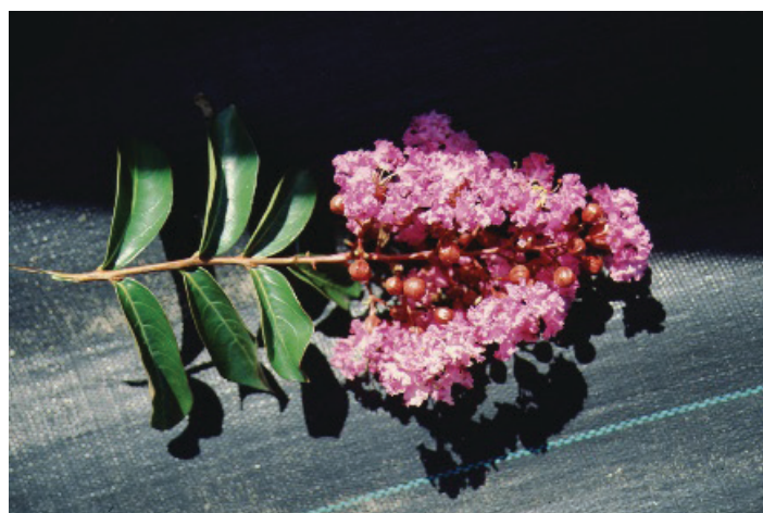
Figure 2. Leaf and Flower - Lagerstroemia indica 'New Orleans': New Orleans Crape Myrtle