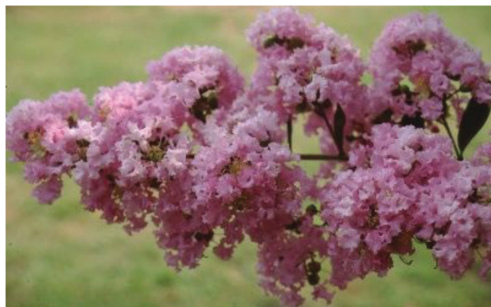
Figure 2. Flower— Lagerstroemia indica 'Yuma': Yuma crape myrtle.