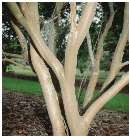
Figure 3. Bark— Lagerstroemia indica 'Yuma': Yuma crape myrtle.