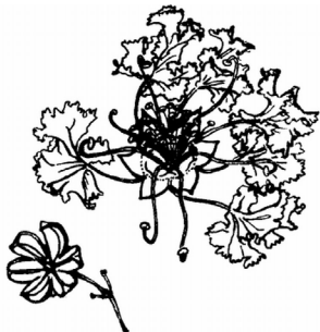
Figure 3. Flower of 'Tonto' crape myrtle

Flower color: red Flower characteristic: spring flowering; summer flowering