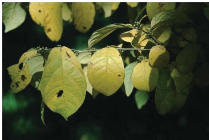
Figure 2. Leaf— Lindera benzoin : Spicebush.