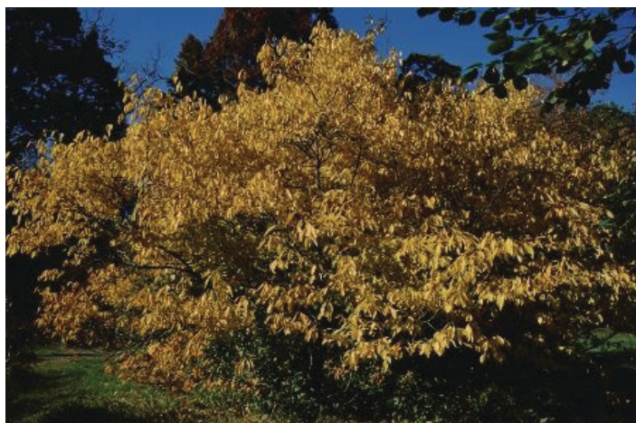
Figure 1. Full Form— Lindera benzoin : Spicebush. Credits: Edward F. Gilman, UF/IFAS

A large shrub, reaching a 10-foot height and spread, spicebush is so named because of its pleasing aroma when bruised. When planted in a sunny location, spicebush will turn a lovely yellow in the fall but when grown in the shade will not be as colorful or grow as densely. The flowers are insignificant, and fruits form only on female plants.