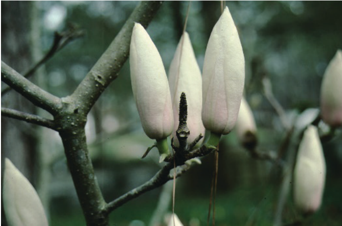
Figure 2. Flower - Magnolia x soulangiana 'Cupcake': 'Cupcake' Saucer Magnolia

Availability: somewhat available, may have to go out of the region to find the plant