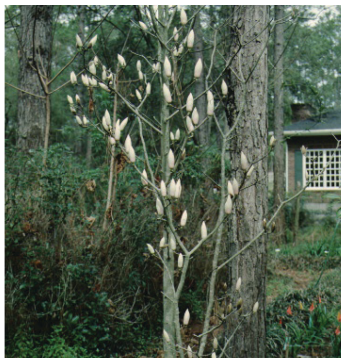
Figure 1. Full Form - Magnolia x soulangiana 'Cupcake': 'Cupcake' Saucer Magnolia

USDA hardiness zones: 5 through 9A (Figure 3)