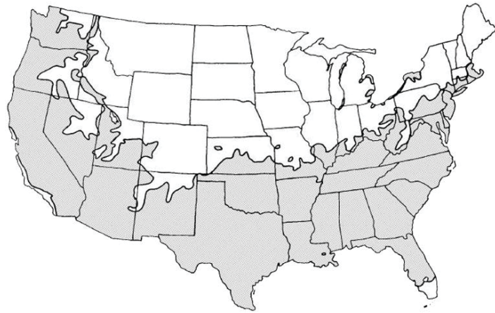
Figure 3. Shaded area represents potential planting range.

Availability: generally available in many areas within its hardiness range