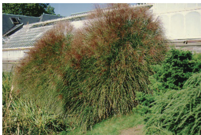
Figure 1. Full Form - Miscanthus sinensis 'Gracillimus': Gracillimus Maiden Grass

USDA hardiness zones: 6 through 9 (Figure 3)