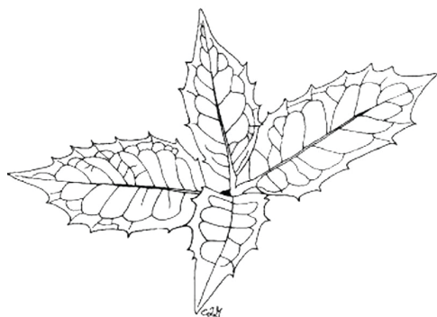
Figure 1. False holly

This large evergreen shrub or small tree is capable of reaching 15 to 20 feet in height and width but is most often seen at 10 to 12 feet high with an 8-foot spread (Fig. 1). Older plants grow as wide as tall and develop a vase shape with several main trunks typically originating close to the ground. The lustrous, dark green leaves have paler undersides and are joined in the fall by a multitude of barely noticeable, but extremely fragrant, white blossoms. They perfume a large area of the landscape.