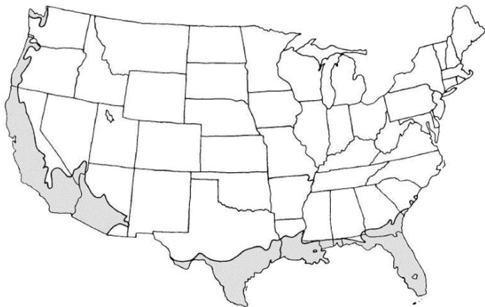
Figure 5. Shaded area represents potential planting range.

USDA hardiness zones: 8B through 11 (Figure 5)