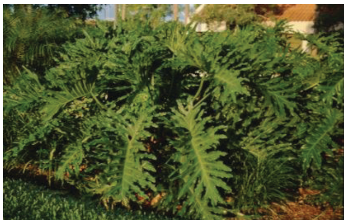
Figure 1. Full Form— Philodendron selloum : Selloum, philodendron selloum.

This large-leaved, easily grown philodendron makes a dramatic, tropical statement wherever it is used in the landscape, eventually developing a 3- to 4-foot-long, tree-like trunk and a spread of 8 to 10 feet. The deeply divided, usually drooping, medium green leaves grow up to three feet long and 12 to 18 inches wide, appearing on long, smooth petioles. It can be grown outside in central and south Florida, and in a protected area in Gainesville or Jacksonville.