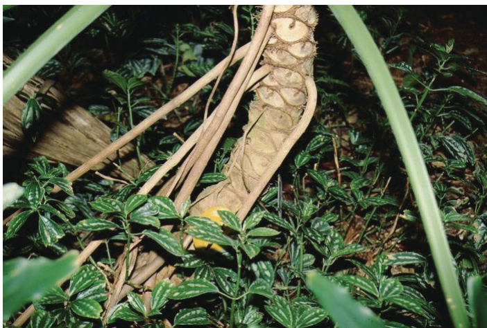
Figure 4. Bark— Philodendron selloum : Selloum, philodendron selloum.