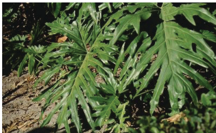
Figure 2. Leaf— Philodendron selloum : Selloum, philodendron selloum.