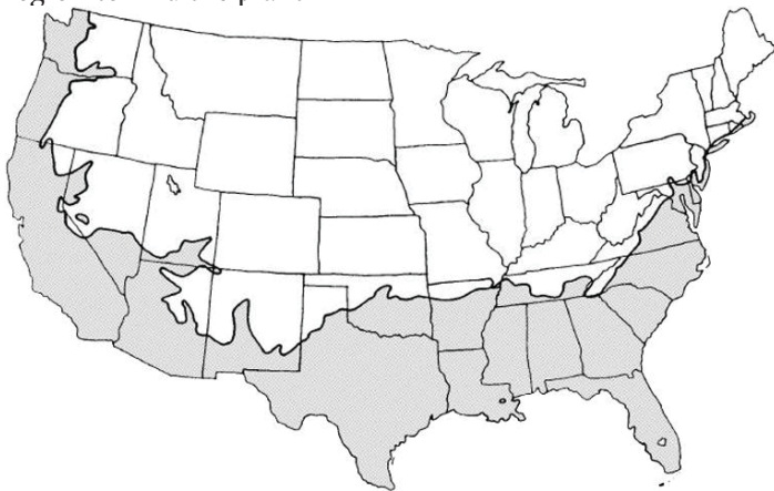
Figure 4. Shaded area represents potential planting range.

Availability: somewhat available, may have to go out of the region to find the plant