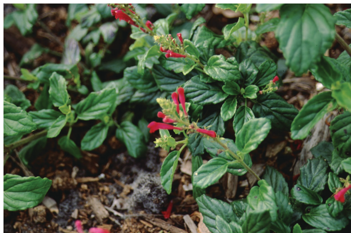
Figure 3. Flower— Salvia x 'Purple Fountain': 'Purple Fountain' salvia.