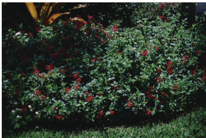
Figure 1. Full Form— Salvia x 'Purple Fountain': 'Purple Fountain' salvia.

'Purple Fountain' salvia is an herbaceous perennial growing about 2 feet tall with an upright habit. The rich, dark green, foliage adds a fine texture to the garden and is unusually glossy compared to other salvias. Its bright red flowers grace the top of the plant throughout the spring, summer and fall seasons.