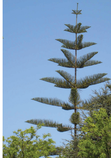
Figure 12. The highly symmetrical, upswept whorls of branches on Norfolk Island pine ( Araucaria heterophylla ) give the tree a very distinctive appearance.

Norfolk Island pine is a conifer in the family Araucariaceae. It is found naturally only on Norfolk Island, a small island in the south Pacific near Australia and New Zealand. The foliage is waxy and variably bright to dark green. Individual leaves are only 0.5 to 0.75 inches (1–2 cm) long and claw-like, but not sharp. The tree is striking at least in part because of its symmetry, with regular whorls of branches around a single straight trunk.