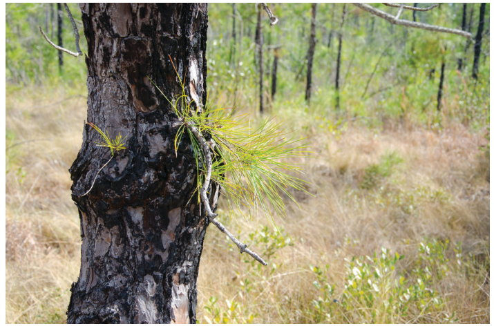
Figure 4. A young pond pine ( Pinus serotina ) showing the characteristic tufts of needles growing from bulges on the trunk.

Pine species with cones that open this way in response to fire are said to be “serotinous.” Like the juvenile “grass phase” of longleaf pines, serotinous cones are an evolutionary adaptation to fire-prone environments. By releasing seeds in response to the heat of a forest fire, they allow a species to take advantage of the bare, exposed soil where germination and early growth is most likely to be successful.