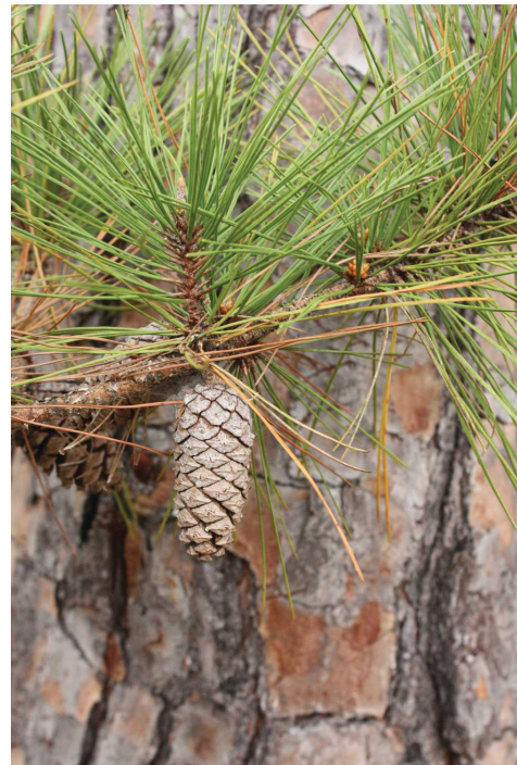
Figure 6. Needles, seed cone, and bark of shortleaf pine ( Pinus echinata ).

Mature shortleaf pines have a tall, straight trunk with branches that tend to be winding or sinuous. The bark of older trees has distinctive flat, reddish-brown plates that resemble jigsaw puzzle pieces. Many small resin pockets (approximately 1 mm in diameter) may be scattered throughout the bark. The scientific name for the species comes from the ancient Greek word for “hedgehog” ( ekhinós ) and refers to the short shoots that develop off the trunk and larger branches, giving the tree a “prickly” appearance.