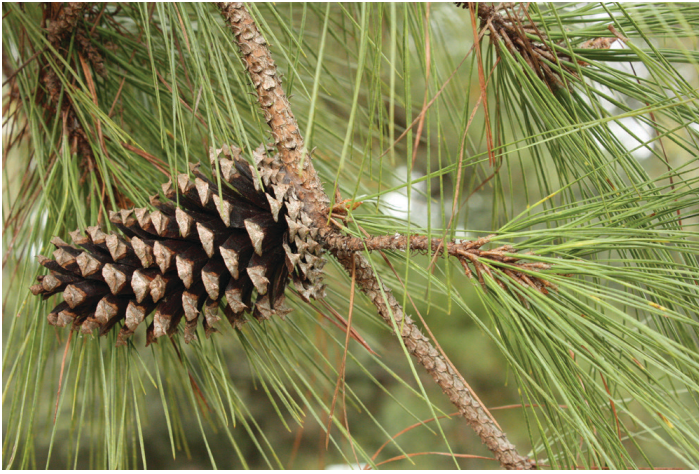
Figure 2. Seed cone and needles of loblolly pine ( Pinus taeda ). The prickle on the umbo of each cone scale points downwards toward the base of the cone and the connection to the branch.

Loblolly pines may attain heights of 80 to 100 feet (25–30 m) and diameters of 1.5 to 4 feet (0.5–1.25 m). Branches in the high crown spread gracefully and may give a drooping appearance.