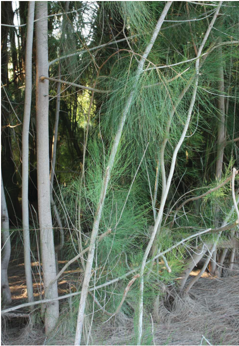
Figure 11. A stand of Australian pine ( Casuarina sp.) with the thin stems that resemble needles. The dense shade and thick carpet of fallen foliage produced by these trees can eliminate any undergrowth.

“Australian pine” is the common name given to several different species in the genus Casuarina . These plants are not conifers (or even gymnosperms) but they get their common name from the slender, green, needlelike branchlets that do most of the photosynthesis for the plant. The branchlets are jointed stems that can be easily pulled apart into segments, and the true leaves appear as small “teeth” in whorls at each joint.