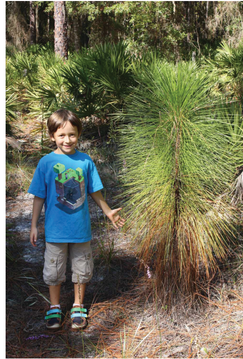
Figure 13. A young human (left) discovers a young longleaf pine (right).