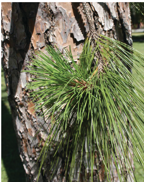
Figure 7. Branch and trunk of slash pine ( Pinus elliotii ). Note the spirally arranged primary leaves or scales that persist on the branchlets and give them a rough surface after the fascicles of needles have fallen.

Historically, slash pine was (with longleaf pine) one of the two primary sources of resin for the production of turpentine and rosin by the naval stores industry. Using the “Herty system,” workers would remove a section of bark and cut an angled slash or “streak” in the wood of the tree. Below the streak, an angled piece of galvanized metal was attached to direct the oozing resin into a tin cup. When one streak stopped producing resin, a new one would be cut directly above the first. Eventually the tree could have several rows of parallel slashes up its trunk. The naval stores industry has all but disappeared in Florida, but slash pines with persisting “cat-face” scars from the resin harvesting can still be found in many old stands.