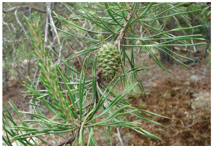
Figure 10. A Virginia pine ( Pinus virginiana ) showing the prickly seed cone and the twisted needles in fascicles of two.

Virginia pine needles are dark yellow green, slightly to strongly twisted, and bound in fascicles of two. They are approximately 1.5 to 3 inches (4–8 cm) long and relatively thick in relation to their length. The seed cones are small, also about 1.5 to 3 inches (4–8 cm) in length, and have a distinctively “prickly” appearance from the long, slender, needle-like spine on each scale.