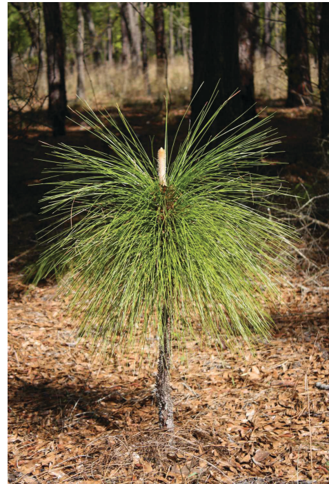
Figure 3. A young longleaf pine ( Pinus palustris ) as it begins to move out of the grass phase and gain height. Note the “white candle” bud at the top of the plant.

Once a longleaf pine has gone through its adolescent growth spurt and developed thick bark, it is safe from ground-level forest fires and can grow at a slower pace. Longleaf pines may eventually reach heights of 80 to 100 feet (25–30 m) and diameters of 2.5 feet (0.75 m). Long boles (trunks) are topped by a small, open crown. The pendulous needles are borne three to a fascicle and are generally 8 to 12 inches (20–30 cm) long, although in some cases they can extend to even 18 inches (45 cm). The bare twigs below the needles are unusually stout (“thumb-sized”) and have a rough surface where the older fascicles have fallen off. The winter buds at the tips of the branches are large, white, and upright, resembling candles on an enormous candelabra.