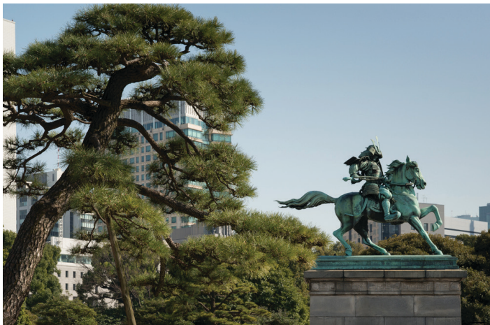
Figure 9. A Japanese black pine ( Pinus thunbergii ) in the Kokyo-Gaien National Garden in Tokyo, Japan. The garden is just outside the Imperial Palace and features over 2,000 Japanese black pines.

One reason for the popularity of this species is its relative salt tolerance. It may be planted successfully in oceanside areas, where the ocean wind often contorts the trunk and branches into a “windswept” shape that resembles a large bonsai specimen. In the United States it is useful as a roadside planting where highways are salted for ice removal.