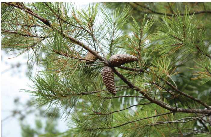
Figure 5. Needles and closed seed cones of sand pine ( Pinus clausa ). Note the thin diameter and smooth surface of the branchlets.

Two varieties of sand pine are recognized in Florida. Choctawhatchee sand pine (var. immuginata ) has cones that open at maturity. Ocala sand pine (var. clausa ) has cones that remain closed until fire sweeps through the stand. Choctawhatchee sand pine is a common choice for reforestation projects on deep sands because it survives transplanting well. The genetically improved Choctawhatchee sand pine is best for Christmas trees and may be sheared and shaped effectively.