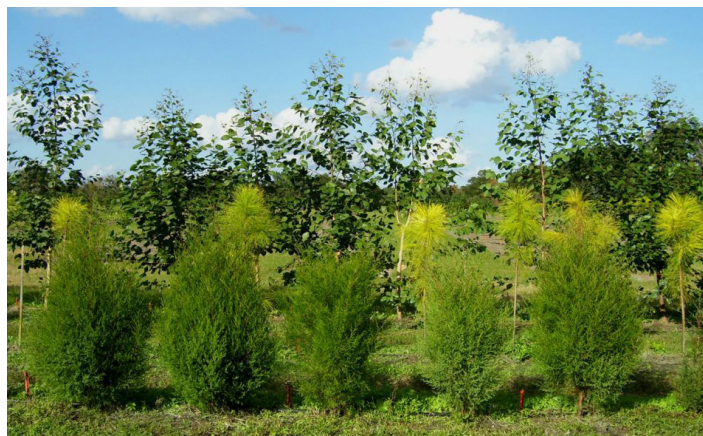
Figure 4. Three-row windbreak around citrus block—eastern red cedar (front), slash pine (middle) and eucalyptus (back row)—at UF/IFAS Plant Science Research & Education Unit, Citra, Florida. Credits: Bijay Tamang, December 13, 2007