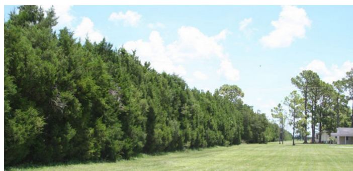
Figure 2. Single-row eastern red cedar windbreak at UF/IFAS Southwest Florida Research and Education Center, Immokalee, Florida. Credits: Bijay Tamang, July 11, 2007