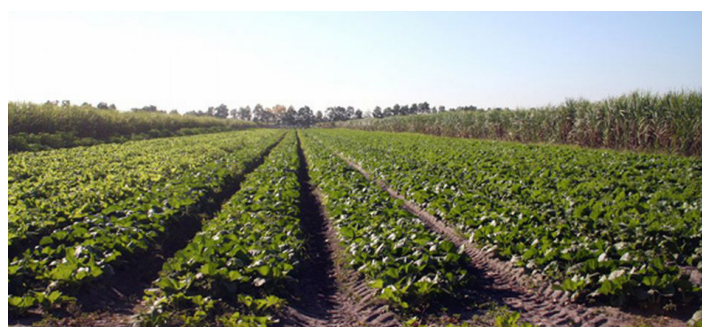
Figure 1. Sugarcane (left and right) and tree (far end) windbreaks around a vegetable farm at C&B Farms, Clewiston, Florida. Credits: Bijay Tamang, December 21, 2007

low establishment and maintenance costs. The primary economic disadvantage is that a living windbreak may take several years to develop; therefore, the economic benefit is not immediate.