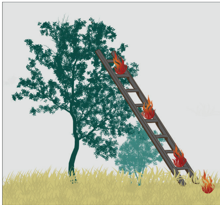
Figure 2. Vertically connected fuels act as ladders for fire to climb from the understory to tree canopies.

All shrubs within the defensible space, defined as a minimum of 100 feet from structures, should be routinely maintained. Dead or diseased plant material should be removed, and shrubs should be pruned to ensure they are not acting as ladder fuels that connect ground fuels to surrounding treetops (Figure 2). Some shrubs can grow as tall as trees and pose a greater danger to homes if they are not pruned. Ideally, the distance from understory to overstory fuels should be at least 2–3 times the height of the understory fuels (Figure 3).