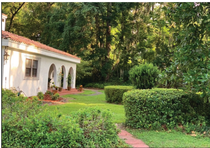
Figure 1. Firewise landscaping includes shrubs that are not adjacent to the home. In this instance, larger shrubs are away from the home, and all plants adjacent to the home are small-statured or potted.

Homeowners should know that even low-flammability, firewise plants may be more flammable during droughts or other extreme fire conditions. It is never advised to plant shrubs, even those with low flammability, against structures or homes (Figure 1).