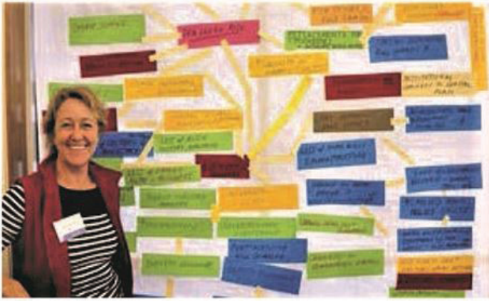
Figure 2. Influence diagram created during a climate roundtable in Southeast Queensland, Australia. Credits: Ross et al. (2012)