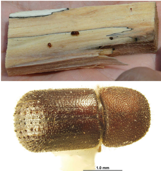
Figure 1. Top: male (left, small size) and female (right, larger size) of Ambrosiodmus minor and their galleries on a piece of decayed wood in Florida. Bottom: Female of Ambrosiodmus minor in dorsal view.