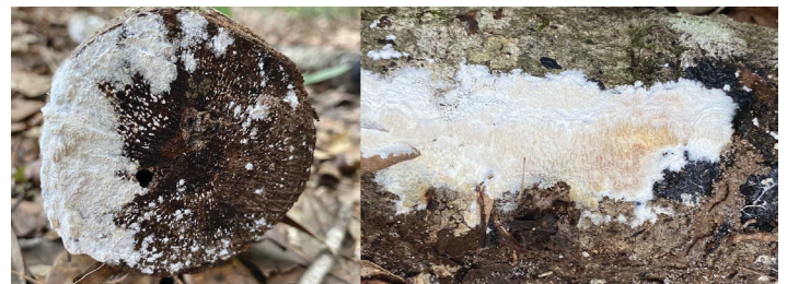
Figure 3. Fruiting bodies of Flavodon subulatus on a Florida oak log. The fruiting bodies are a white crust with a surface composed of irregular pores. The fruiting bodies can sometimes be observed on logs previously colonized by Ambrosiodmus minor .

The majority of known associations between ambrosia beetles and ambrosia fungi involve Ascomycota fungi (the largest phylum of fungi), which do not decay wood. Instead these fungi depend on fresh tissues because they extract simple nutrients from freshly dead tree tissue. On the other hand, Flavodon subulatus is a genuine wood-rot fungus. Flavodon subulatus produces white rot, where both lignin and cellulose are broken down, leaving behind degraded wood that is white and soft (Figure 3). Accordingly, the Ambrosiodmus-Flavodon colonization starts the wood-decay process. The beetle-associated fungus Flavodon subulatus degrades cellulose and lignin rapidly, decomposing the wood faster than many native decay fungi (Kasson et al. 2016).