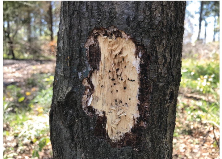
Figure 2. A typical cluster of galleries of Ambrosiodmus minor on a fire-stressed laurel oak in Florida, exposed by woodpeckers.

Wood colonized by A. minor shows distinct areas of white rot surrounding the gallery entry holes (Figure 2). Galleries are typically clustered, which is unusual among ambrosia beetles. The entrance hole has a perfectly circular shape and 1.5 mm diameter. Most native wood borers with holes of this size have entrances less circular, and their holes are less aggregated.