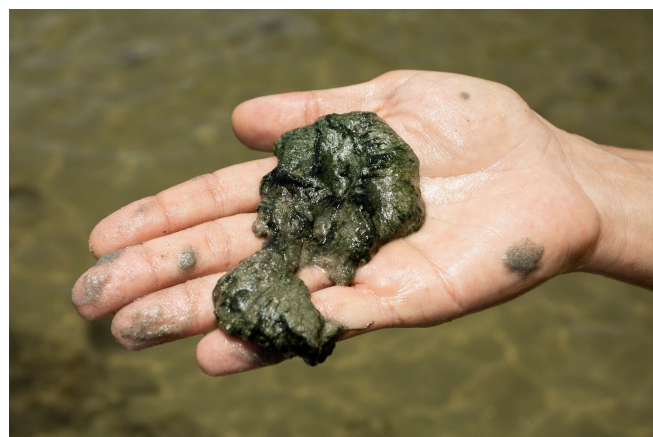
Figure 2. Algae in the palm of a hand. Photo taken 07-10-2019.

replacement of withdrawn groundwater with contaminated water recharge results in an increasingly polluted groundwater supply.