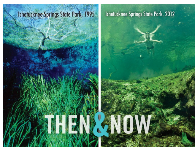
Figure 3. Then and Now. Algae takeover at Ichetucknee Springs State Park, FL, 1995 and 2012. Photos in identical locations.

Throughout north central Florida and southwestern Georgia, groundwater discharges into freshwater springs. Over recent decades, increases in groundwater nitrate concentrations have been associated with eutrophication and degraded springs ecology in both states: many spring runs have experienced more nuisance aquatic vegetation, reduced clarity, and harmful algal blooms (Berndt et al. 2014). Springs degradation can negatively impact water recreation and related enterprises in local and regional economies. Signs of degraded spring water quality serve as warnings for regional groundwater quality.