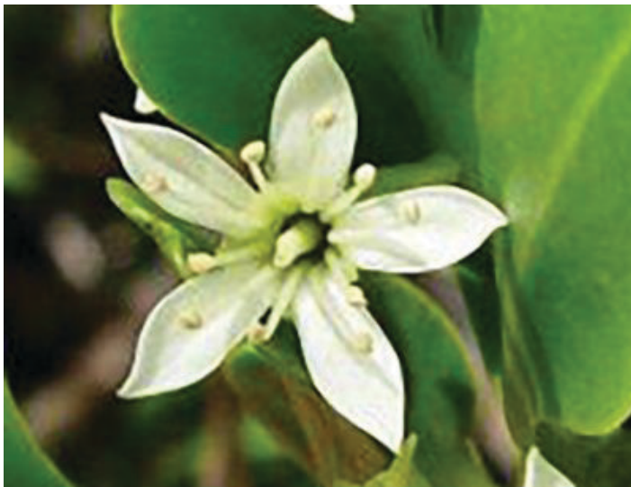
Figure 5. Lumnitzera racemosa flower.