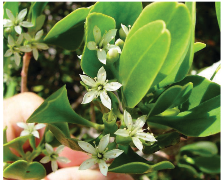
Figure 4. Lumnitzera racemosa emarginate leaf apex and white flowers.

Credits: Jennifer Possley (Wunderlin et al 2024)