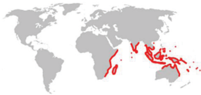
Figure 1. Native distribution of Lumnitzera racemosa .

pubescence at times. The invasive black mangrove does not have aboveground roots; however, it is unique in its ability to produce adventitious roots in moist environments. Flowers are small, sessile, and white (Figure 5). The fruit are small (<1 in) and yellowish green, with either a glossy, glabrous, or pubescent appearance.