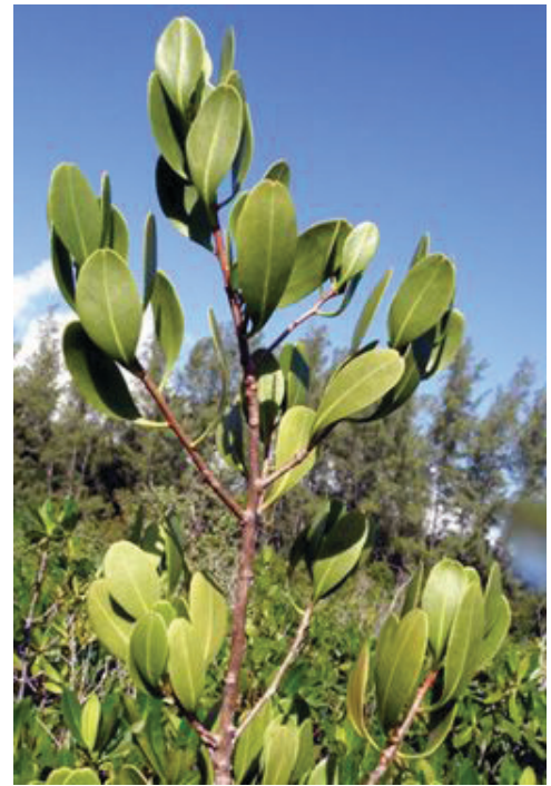
Figure 3. Lumnitzera racemosa —leaf arrangement is alternate.

There are a few key features to look for when differentiating Lumnitzera racemosa from native Florida mangroves. Use the lists of characteristics below to distinguish between non-native black mangrove and native Florida mangrove species.