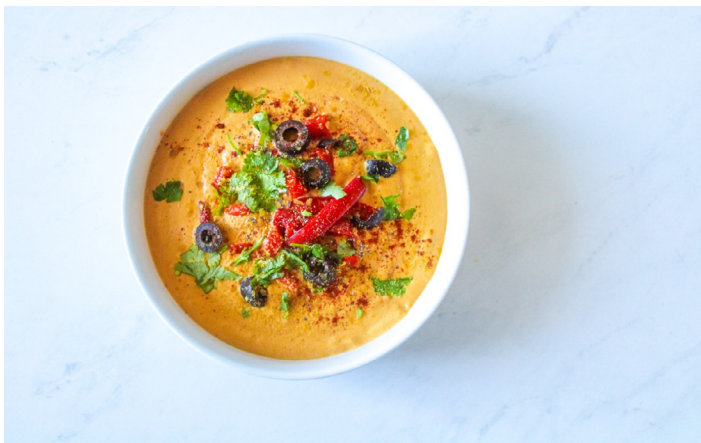
Figure 2. Cashew Queso.