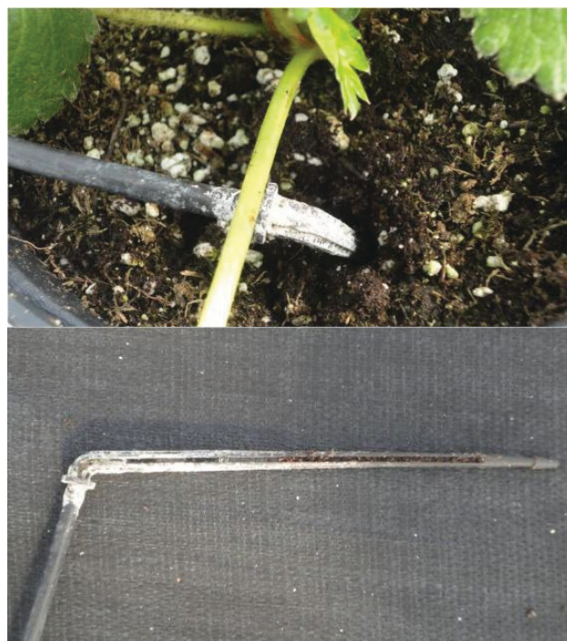
Figure 2. Scale-like deposits in a microirrigation system for peach production.

Since fertigation is a combination of irrigation and fertilization, clogging problems can be traced back to either the water supply or injected fertilizer.