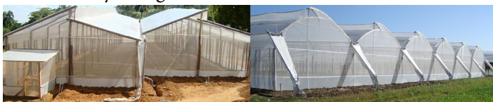
Figure 3. Multi-chapel (left) and semi-cylindrical (right) greenhouse units with passive ventilation on roofs.

This permanent structure has a roof with two tilted surfaces, between 25° and 45°, and is oriented according to wind speed and rainfall. It has either active or passive ventilation through the roof and sides. It's made of wood or steel and ranges in height from 12 to 20 ft (Figure 3). Multi-chapel units are composed of single units attached to each other by rain gutters.