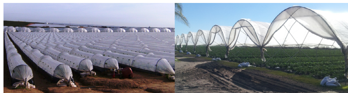
Figure 4. Low (left) and high (right) tunnels for vegetable and small fruit production.

High tunnels are passively ventilated structures built with metal (e.g., galvanized steel or iron), plastic (e.g., polyvinyl chloride [PVC] pipes), or wood, which is usually covered with one or more layers of plastic film and anti-insect screen (Figure 4). Their height is generally between 10 and 16 ft, and they are recommended for indeterminate-growth cultivars, which cannot be grown under low tunnels. Their height also allows for personnel and large agricultural equipment, unlike low tunnels.