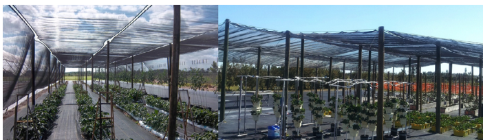
Figure 2. Shade houses for vegetable and small fruit production.

because of the high incidence of physiological disorders and propagation of disease-causing pathogens. Both shade houses and screen houses have very low initial costs (<$0.50/ft 2 ) and maintenance.