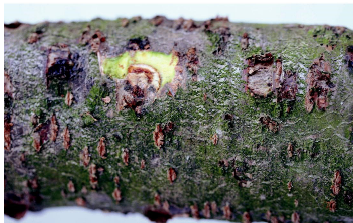
Figure 3. A peach limb with the blister symptom of fungal gummosis caused by Botryosphaeria dothidea .

After initial infection, necrotic lesions in phloem and cortex tissues (Figure 2B) continue to expand under the bark. In old tissue, sunken necrotic lesions form and will frequently be sites of gum release. The most noticeable symptom of infection is the gum exudates on the stems and branches of the tree (Figure 4). Vascular clogging from