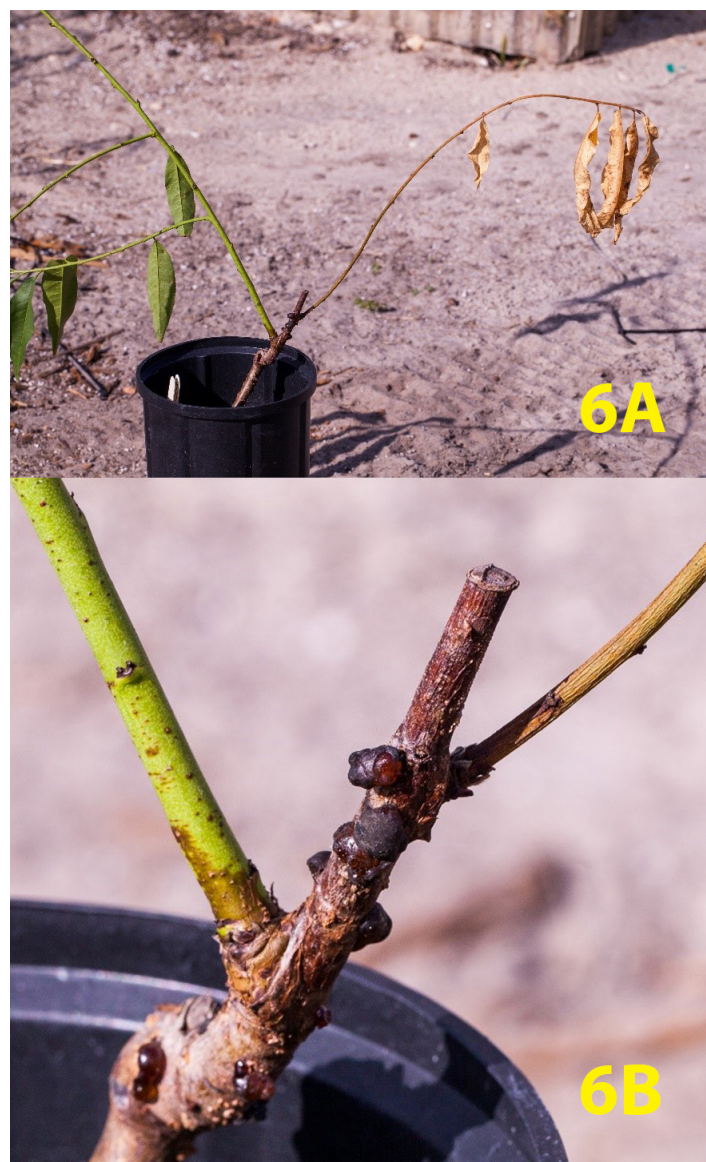
Figure 6. Grafted peach (6A) and a magnified view (6B) with gumming lesions and dieback from the top caused by Botryosphaeria species.

Symptoms vary depending on the season, and susceptibility to this disease is highly variable among peach cultivars (Beckman et al. 2012; Beckman and Reilly 2005). Symptoms are most visible in the southeast from June to October.