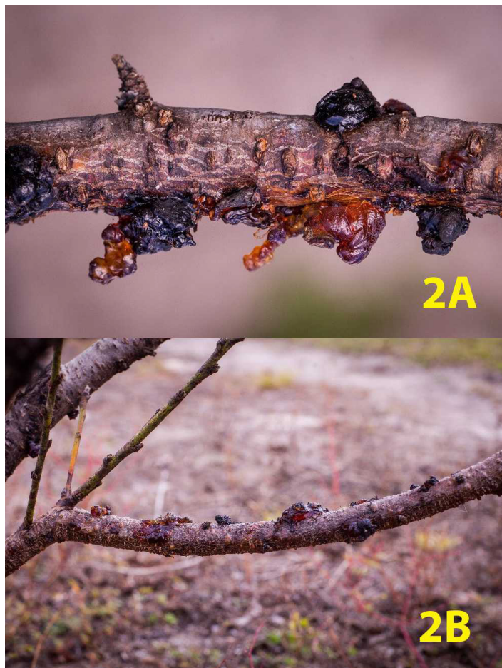
Figure 2. Two-year-old peach scaffold (2A) with swollen lenticels and gumming secretion (2B) caused by Botryosphaeria spp. infection.

The earliest symptoms of fungal gummosis are raised blisters 1–6 mm in diameter that appear on the natural openings, such as stomata and lenticels, of young shoots, or near wounds (Figure 2A) (Figure 3). These blisters will generally have a lenticel at their center, which is where the pathogen, usually B. dothidea , has infected the bark (Pusey 1986; Weaver 1974). The raised blisters are caused by hyperplasia (the abnormal multiplication of the plant cells) of the peridermal and cortical cells near lenticels.