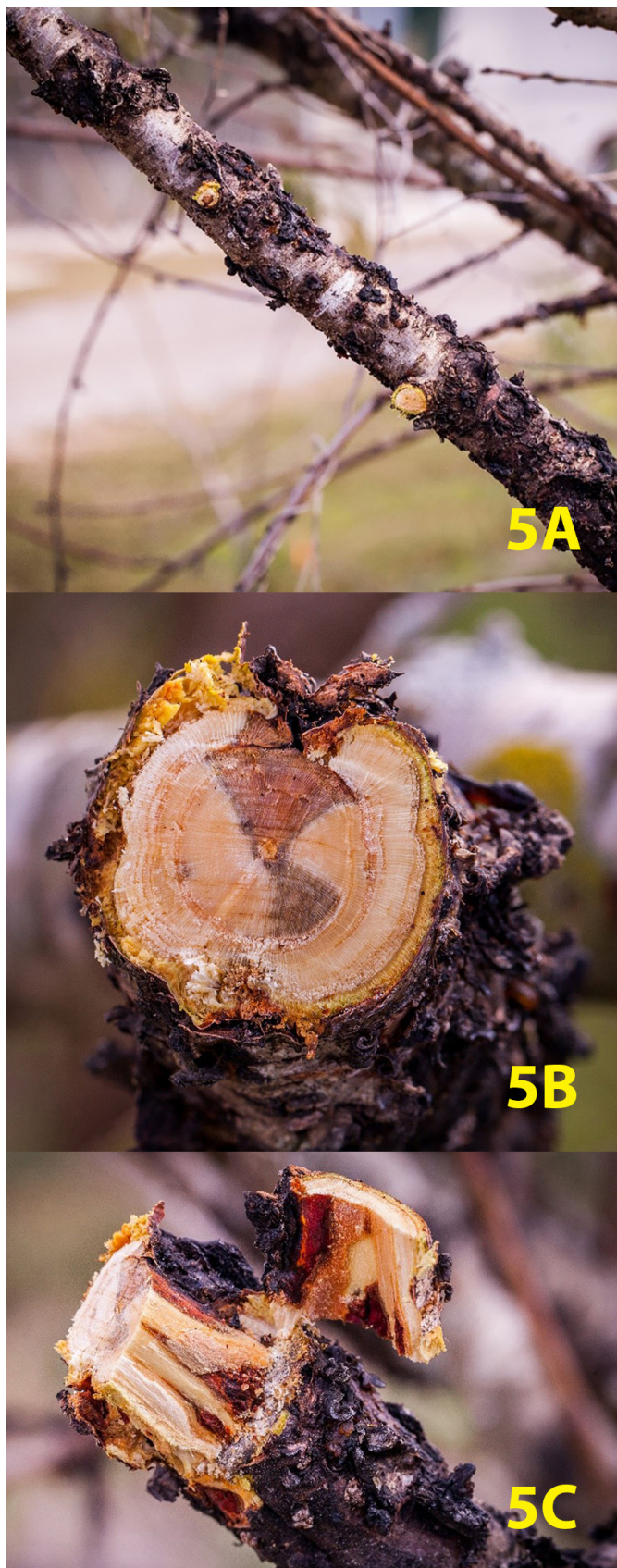
Figure 5. An infected peach branch (5A), a horizontal cut (5B), and bark partially removed (5C) to reveal the infection is erupting through the bark and discoloration in the phloem and xylem tissue on a Botryosphaeria diseased branch.