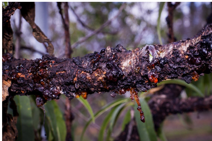
Figure 1. Peach limb with a severe fungal gummosis infection by Botryosphaeria spp.

In the southeastern United States, PFG has been reported since the early 1970s in major peach-producing areas where the damage may reduce the yields up to 40% (Weaver 1974; Biggs and Britton 1988; Beckman, Pusey, and Bertrand 2003). This disease was first reported on peach and citrus trees in Florida in 1911 by Fawcett and Burger. Taxonomy