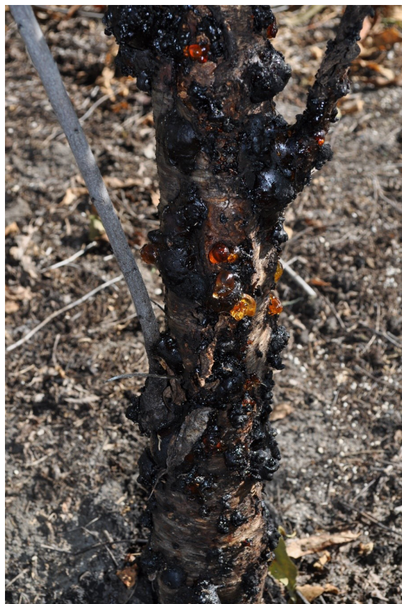
Figure 4. 'Flordaguard' peach rootstock infected with fungal gummosis showing gumming lesions and swollen lenticels.