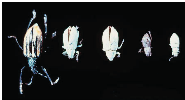
Figure 1. Photo of all 5 weevils allows size differences to be seen. From left to right, Diaprepes, Citrus root weevil, Northern citrus root weevil, Fuller rose beetle, Little leaf notcher.

Adult citrus root weevils vary widely in size and color among species and sometimes within species. Most species can fly short distances which aids dispersal over a limited geographical area. The little leaf notcher and Fuller rose beetle are flightless.