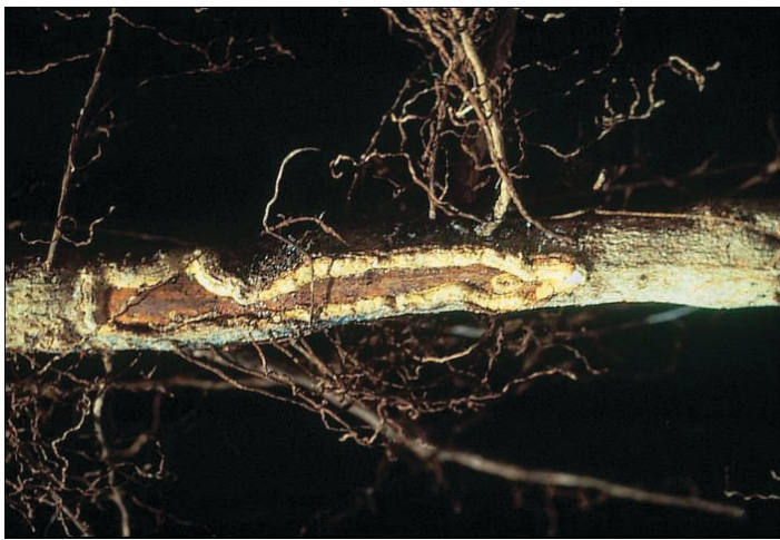
Figure 3. Root system damaged by Diaprepes larvae feeding.

Feeding damage by older larvae may be seen on major lateral roots (Figure 3) and in the crown region when a tree is removed from the soil.