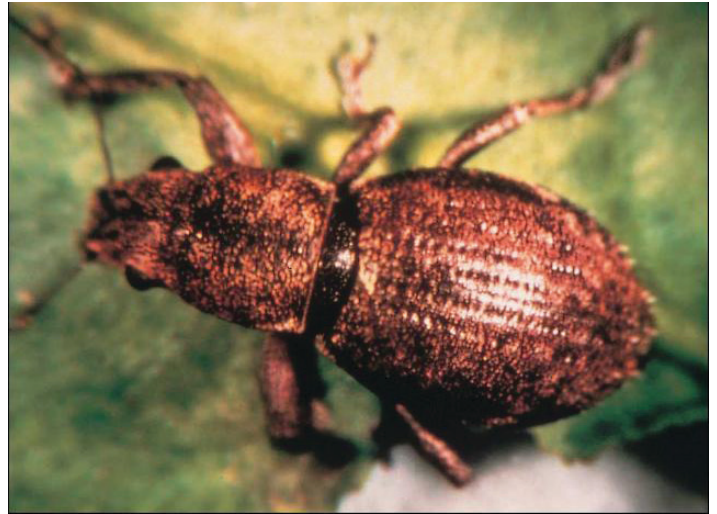
Figure 8. Fuller rose beetle.

Adults are brownish to grey in color, about 0.33 inch long and can be found throughout the year (Figure 8).