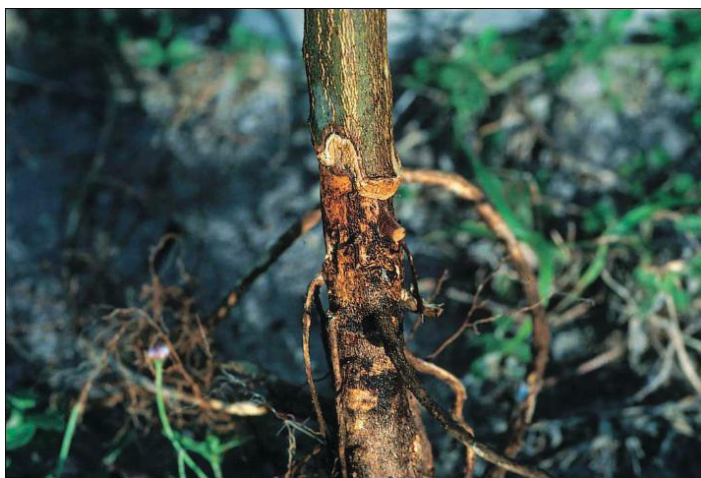
Figure 11. Termite damage to tree.

When groves have been developed from pine and palmetto woodlands harboring a natural termite infestation, problems have developed when land clearing operations have left wood in the soil which provided a food source for termites. When the food supply becomes limited, termites may feed on the bark of the live tree trunk in a ring between the soil line and crown roots causing girdling and possible tree death. Feeding may advance above the soil line (Figure 11).