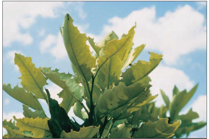
Figure 4. Leaf damaged by Diaprepes adult feeding.

The Diaprepes root weevil, also referred to as the sugarcane rootstalk borer weevil, was first reported in Florida in 1964 near Apopka. It is a major pest of citrus as well as many other plants (crops and ornamentals) grown in Florida and the Caribbean area.