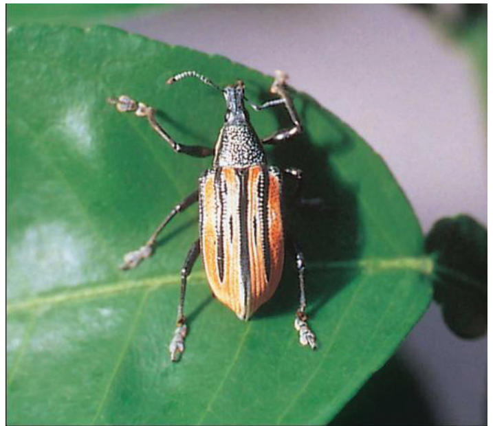
Figure 5. Diaprepes root weevil adult.

This is the largest and most devastating weevil found in Florida citrus. The adult weevil is 0.37 to 0.75 inch in length. The adult wing covers have a black background with orange, gray or white bands (Figure 5).