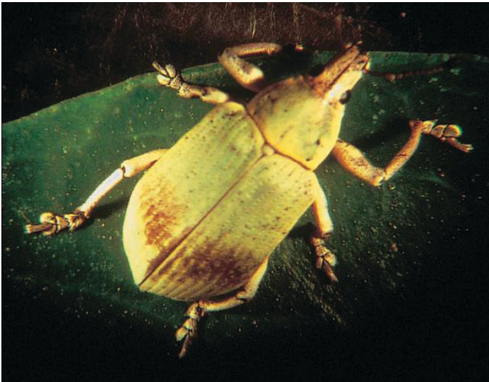
Figure 7. Southern citrus root weevil.

The species are closely related and overlap in central Florida and are very similar in appearance and behavior. They are bright blue-green to aqua in color.