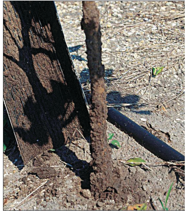
Figure 13. Fire ant damage to young citrus tree.

For more information on soil insect pests, you may wish to consult the annual Florida Citrus Production Guide published by the University of Florida Institute of Food and Agricultural Sciences, Gainesville, Florida.