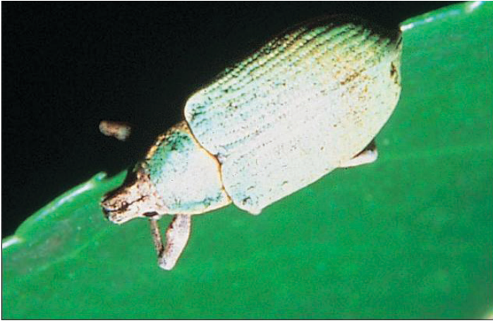
Figure 6. Northern citrus root weevil.

Pachnaeus opalus is found in the northern areas of Florida and Pachnaeus litus is found in southern Florida (Figures 6 and 7).