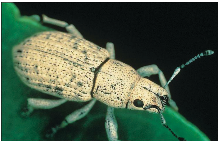
Figure 9. Little leaf notcher.