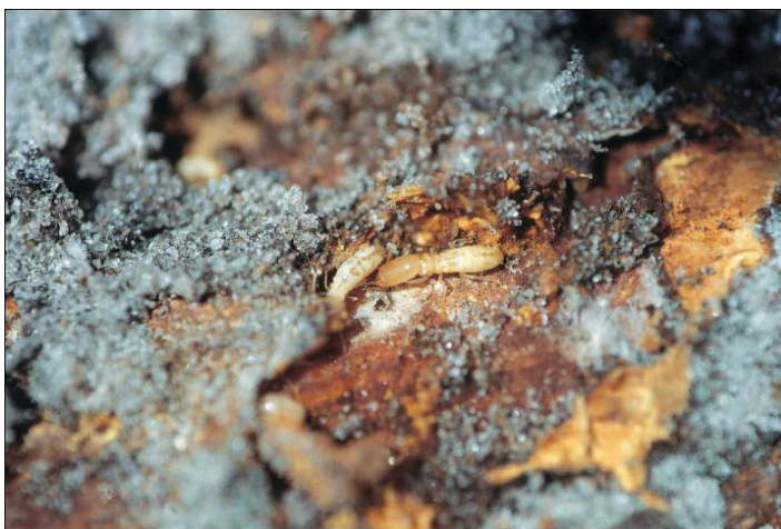
Figure 10. Termites.

Subterranean termites generally do not feed on living plants and can be found on dead and decaying woody plant material. Subterranean termites are 0.20 inch in length and white to yellow in color. They are similar in appearance to ants (Figure 10).