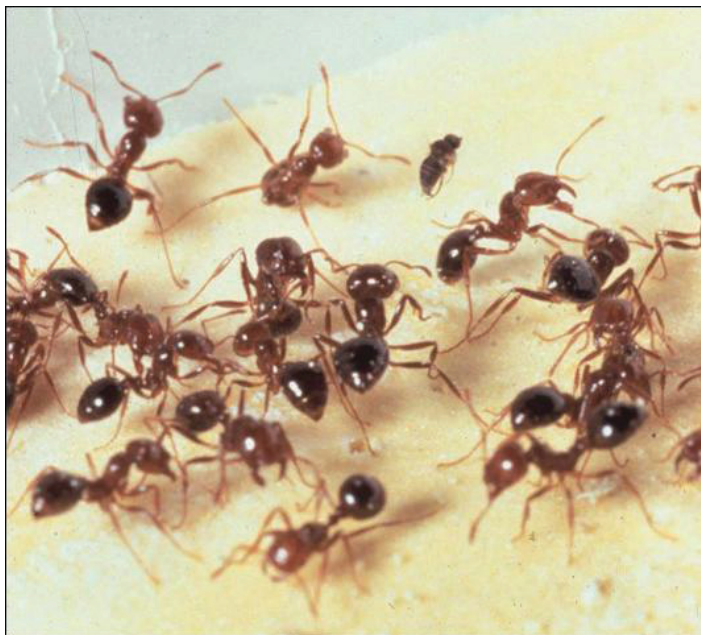
Figure 12. Fire ants.

Many different species of ants are found in citrus groves. Some ants are beneficial, feeding on other pests of citrus, whereas others may be quite disruptive of biological control agents that attack citrus pests. Ants range in size from as small as 0.13 to 0.5 inch (Figure 12).