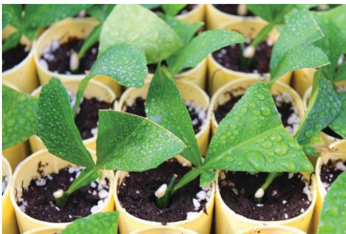
Figure 12. Rootstock cuttings.

is popular, especially with citrus rootstock breeders who usually do not have seed source trees available for their new selections, is the propagation of rootstocks through cuttings. For this method, single node cuttings, about 1 inch in length, are removed from woody sections of 2–5-month-old branches of certified disease-free citrus plants. The leaf remains attached to the node to allow photosynthates to be delivered to the developing roots but can be reduced to a length of 20%–30% of its original size. The basal end of each cutting is then dipped into a rooting powder containing a root-stimulating hormone, such as indole-3-acetic acid (IAA) or naphthalene acetic acid (NAA) and inserted into pre-moistened potting medium (Figure 12). Cuttings need to be kept under high-moisture conditions for the plants to survive in the absence of a root system. This can be accomplished by placing plants in an enclosed high-humidity environment and/or using an automated misting system. Under these conditions, a young plant will usually develop within several weeks after planting. Once cuttings have rooted and plants have begun to grow, care can be continued with standard procedures used for seedlings.