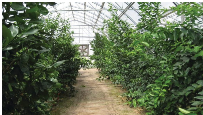
Figure 2. Budwood trees.

stems are ¼ to ¾ inch in diameter (about the diameter of a pencil). Budding can be done anytime the rootstock is in a condition of active growth and the bark is slipping (the bark separates easily from the wood underneath), which is usually from April to November, depending on location. It is important to keep the stock plants (the rootstock liners) well-watered and fertilized prior to budding. The area to be budded should be pruned clean of thorns and twigs. The preferred budding height is 6–8 inches above the base of the stem.