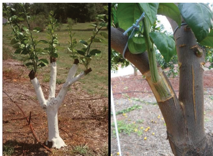
Figure 11. Top-worked trees.

Top-working is the process of changing the top of an established tree from one cultivar to another, or to multiple cultivars, by budding or grafting. Several procedures may be used when top-working citrus trees. They include bark grafting, cleft grafting, and T budding. To top-work a citrus tree by T budding, prune the tree back to leave only a few branches of 2–5-inch diameter or smaller. Insert 1–3 buds on the upper side of the remaining scaffold limbs using the T bud method. Remove unwanted buds and sprouts to ensure that only the desired scion buds grow. If limbs are so large that budding would be difficult, prune back to major scaffold limbs, removing the entire top (caution: severely pruned trees should be whitewashed to prevent sunscald). After limbs sprout back and mature a bit (6 months or so), the sprouts can be budded as initially described, using 4–6 of the stronger sprouts on each limb (Figure 11).