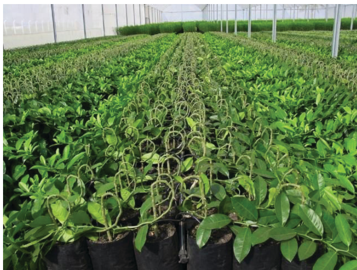
Figure 8. Bending of rootstock liners to force buds.

10). The top should be pinched out to stimulate lateral shoot development.