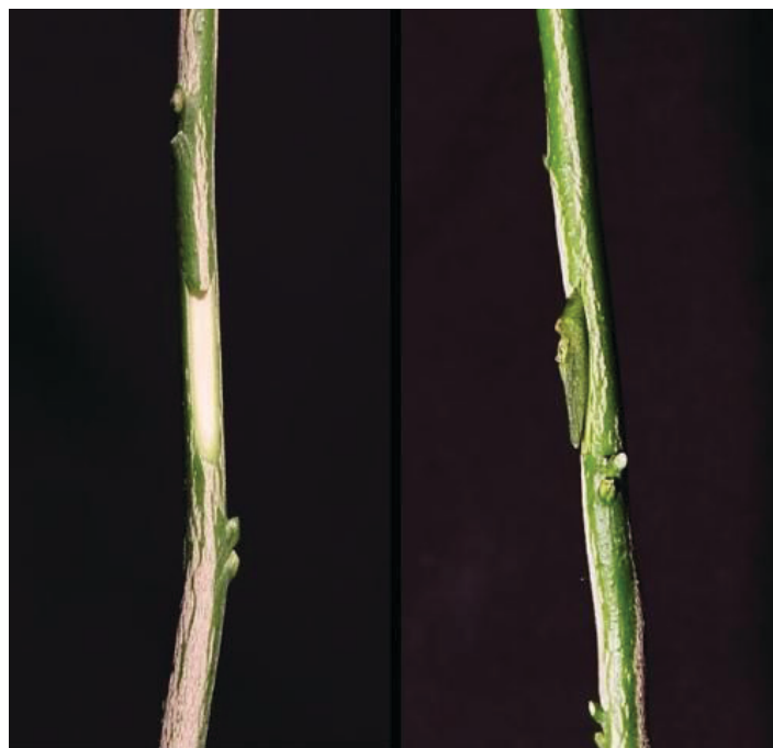
Figure 7. Chip budding.

Chip budding requires slightly more skill than T budding and is usually done whenever the bark of the rootstock plant is not slipping or has become too thick to T bud. The chip bud is cut while holding the budstick with the apical end toward the budder. A thin slice of wood with a scion bud is removed by making a smooth upward cut about 1 inch long and just into the wood. A second cut is made at the top of the first cut, forming a notch. A chip is removed from the rootstock in a similar manner (Figure 7) and the scion bud is placed on the cut to match the cambium. Cambial tissue is a thin layer between the bark and the wood of a tree. This is an area of active cellular growth. Because only two thin lines of cambial tissue are available for healing on both the scion bud and rootstock, it is important that matching on both sides occurs whenever possible. The scion should be wrapped as described for T budding so that all cut edges are completely covered.