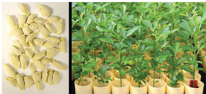
Figure 1. Citrus rootstock seeds and seedlings.

Seeds can be purchased or extracted from mature citrus fruit. To avoid introduction of any potential disease agent, fruit should be rinsed prior to seed extraction in diluted (20%) sodium hypochlorite (bleach). In addition, seeds should be disinfected, followed by a thorough rinse with water. A short treatment in dilute potassium hydroxide or overnight incubation of the seeds with the enzyme pectinase will remove any fruit tissue adhering to the seeds after extraction. After rinsing the seeds, they should be spread out evenly on non-stick paper or aluminum foil and completely dried without direct exposure to sunlight. Seeds can be planted directly, but this is not recommended as a drying period is generally required for optimal germination. Dried seeds should be placed in polyethylene bags and stored at 40–45°F (4–10°C). For long-term storage seeds should be treated with a fungicide. Seeds should be planted at a depth of ¼ to ½ inch in suitable pots or flats containing sterile potting medium. Removing the seed coats, or soaking seeds in aerated water for about eight hours just prior to planting, can reduce the time required for germination and seedling emergence. Under ideal conditions (sunlight, warm soil, and sufficient moisture), emergence will occur within 2–3 weeks after planting (Figure 1). Plants should be trained to a single stem (no branches within 6–8 inches of the soil).