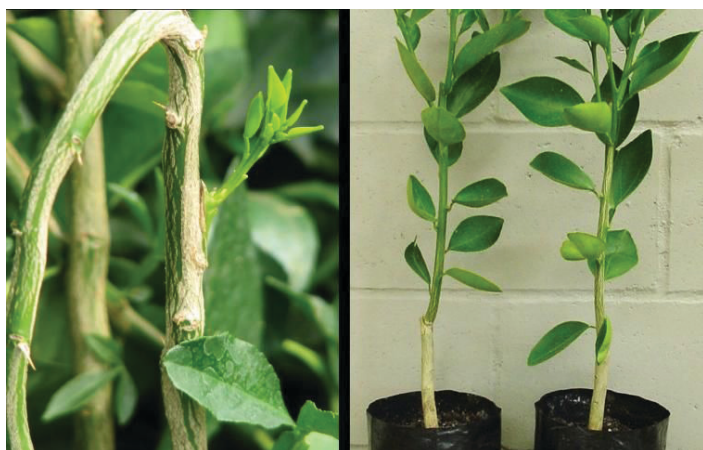
Figure 9. Buds beginning to grow (left) and finished trees (right).