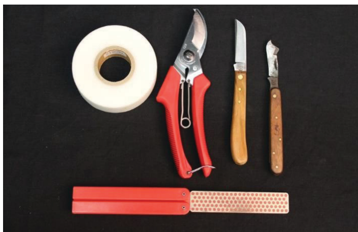
Figure 4. Budding tools. From left to right: budding tape, hand pruner, budding knives. Bottom: sharpening stone.

The most important tool for successful budding is a razor-sharp budding knife, which can be purchased at specialty stores or at garden supply stores (Figure 4). A smooth, clean cut is necessary to allow for maximum contact between the scion and rootstock during the healing process. In addition, a sharpening stone and honing oil are needed to prevent the blade from becoming dull with use. The purchase of a diamond sharpening stone will eliminate the need for use of oil. Polyethylene budding tape (available in clear or green) is used to wrap buds to prevent drying and promote bud union formation. Using clear tape allows for observation of the bud union during the healing process.