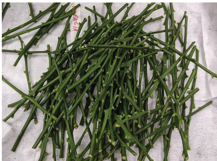
Figure 3. Budwood.