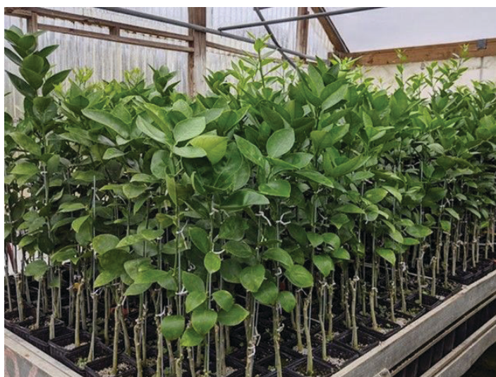
Figure 10. Field-ready trees.