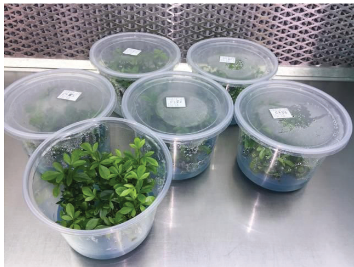
Figure 13. Micropropagated rootstocks.

clusters (Figure 13). After an elongation phase, clusters are separated into individual shoots. Depending on the preference of the nursery, individual plants are then either rooted on agar medium before transplanting or directly rooted into potting medium. After an acclimatization period under high-humidity conditions, young plants can be managed using the same procedures applied for seedlings. Use of tissue culture allows the rapid propagation of large numbers of identical and disease-free plants and has become routine for many fruit crop systems.