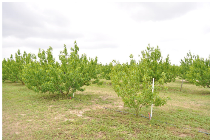
Figure 2. Damage symptoms caused by root-knot nematodes on peach. Trees on the left are healthy, but the one on the right shows yellowing, stunting, and reduced vigor.

dependent on the population density of juveniles in the soil. The aboveground symptoms include stunting, yellowing, premature leaf drop, and reduced vigor (Figure 2). The symptoms mock those caused by other factors such as nutrient deficiencies, water stress, and root injuries from other root-damaging pathogens and pests. These symptoms become most apparent near the end of the growing season (late summer or fall) and may be most pronounced when infected trees are under stress from lack of moisture. The leaves turn pale-green to yellowish in color, and older leaves may drop prematurely due to the reduced level of photosynthates to support plant growth. With the reduced foliage and lower carbohydrate reserves in the roots, the following season’s fruit yield and quality are reduced on bearing trees grafted on susceptible rootstocks (Figures 3 and 4).