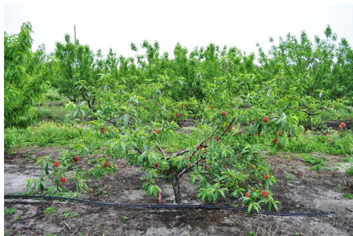
Figure 3. Reduction in foliage is resulting in the production of poor quality fruit.