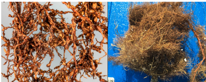
Figure 4. Differences between peach tree root infected by root-knot nematode, Meloidogyne floridensis (left) and non-infected root (right).