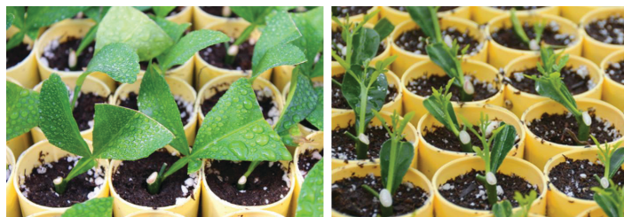
Figure 2. Freshly cut single internodes placed in potting mix with leaf blade attached but reduced in size. Right: Young rootstock sprouts growing from the buds of the internodes. Leaf blades are removed for better visualization.