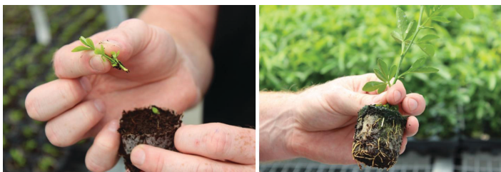
Figure 4. Left: Tissue-culture-generated shoots placed into potting medium for rooting. Right: Young tissue-culture-generated rootstock seedling several weeks after rooting.