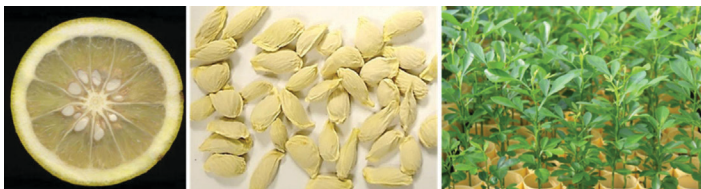
Figure 1. Citrus rootstock fruit (left), extracted dried seeds (center) and young rootstock seedlings (right).