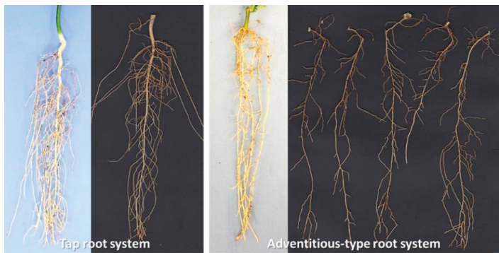
Figure 5. Typical seedling root system (left) and cutting-derived adventitious root system (right) of young citrus rootstock plants.

The root systems of plants generated from seeds or from cuttings and tissue culture are quite different. Contrary to plants grown from seed which generally have a single and well-defined taproot from which multiple smaller roots arise, plants generated from cuttings and by tissue culture have multiple adventitious or lateral roots instead of a taproot (Figure 5).