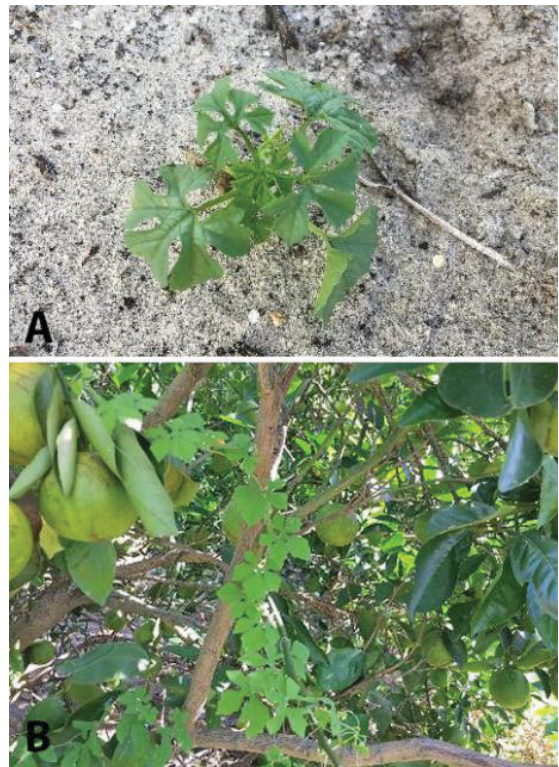
Figure 4. Balsam apple vine, a member of the Cucurbitaceae family, a) as a young plant, and b) as a mature vine.

transferred from infected hosts to healthy plants via the whitefly, Bemisia tabaci (Baker et al. 2008). Viruses spread by insect vectors are especially important to monitor for in the field and surrounding weedy areas because these insects are often very efficient in moving the virus relatively long distances in a short period of time.