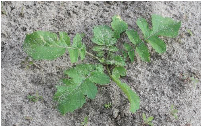
Figure 3. Wild radish, a member of the Brassicaceae family.

Crops in the Brassicaceae family are collectively known as crucifers or mustards and include broccoli, cabbage, radish, and other important vegetable crops. Wild radish, Raphanus raphanistrum , is a common weed found in disturbed areas like abandoned fields and along roadways. It has been demonstrated to be a host of Beet western yellows virus , which can cause yellowing, stunting, and leaf abnormalities in many leguminous crops, as well as canola (also known as rapeseed), a brassicaceous seed crop, and lettuce (Aftab and Freeman 2013, Zitter and Provvidenti 1984).