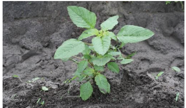
Figure 1. Palmer amaranth, a member of the Amaranthaceae family.

The amaranth family, Amaranthaceae, contains some important crop species, like spinach, beets, and quinoa, as well as pigweeds ( Amaranthus spp.), a group of some of the most difficult-to-eradicate weeds. Palmer amaranth, Amaranthus palmeri , is a particularly aggressive and hard-to-control weed in Florida. Palmer amaranth along with lambsquarters ( Chenopodium album ) have been demonstrated to act as reservoirs of Tobacco rattle virus , which can cause chlorotic mottling or yellow streaks on sugar beet, tobacco, and potato (Dikova 2006, Goyal et al. 2012).