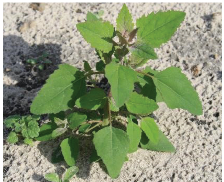
Figure 2. Common lambsquarters, a member of the Amaranthaceae family.