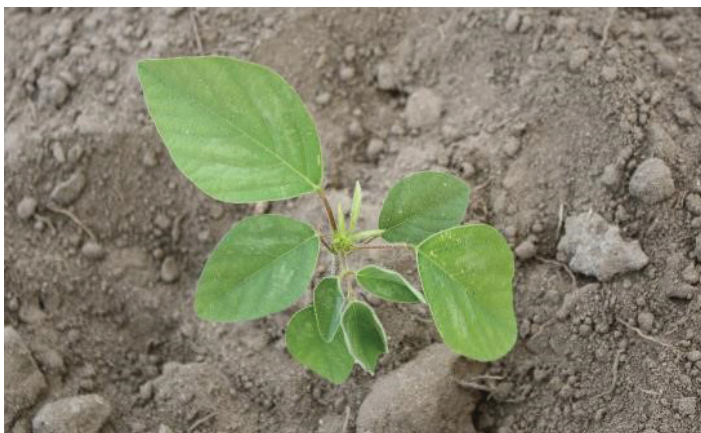
Figure 5. Florida beggarweed, a member of the Fabaceae family.