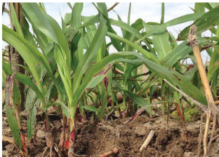
Figure 7. Johnsongrass, a member of the Poaceae family.