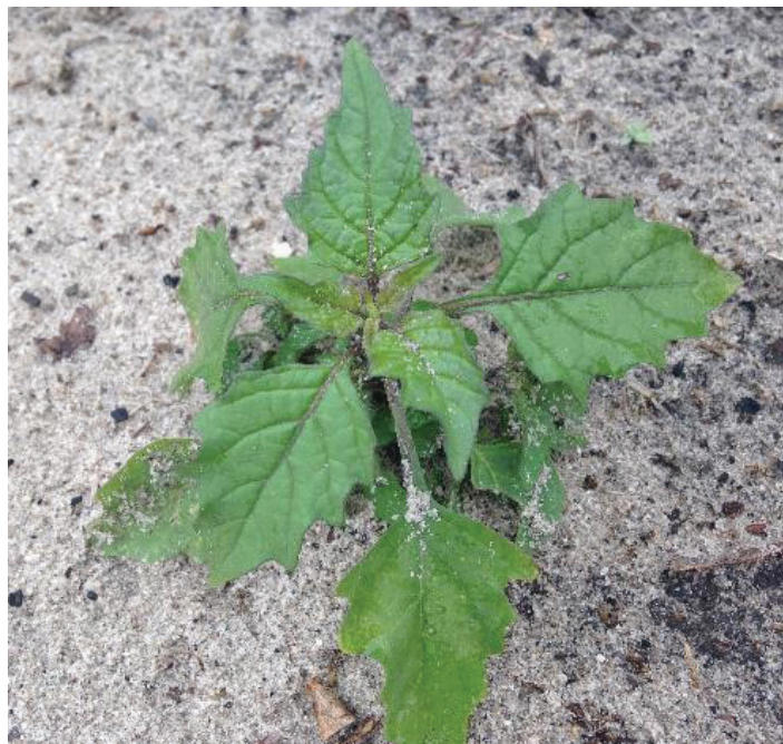
Figure 8. Jimsonweed, a member of the Solanaceae family.

This family is often referred to as the nightshade family and contains many common vegetable and field crops, such as tomato, pepper, and tobacco. It also contains some important weed species, such as groundcherry ( Physalis sp.) and Jimsonweed ( Datura stramonium ). Several viruses that affect pepper and tomato, including Tomato mosaic virus and Potato virus X , can infect Jimsonweed and cause it to act as a reservoir (Alemu et al. 2002). Tomato mosaic virus infection produces various symptoms in solanaceous crops, mainly abnormal, chlorotic patterns on young leaves and overall stunting of the plants. Potato virus X infection results in a mild leaf mottling of infected plants, including weedy hosts (Koenig and Lesemann 1989).