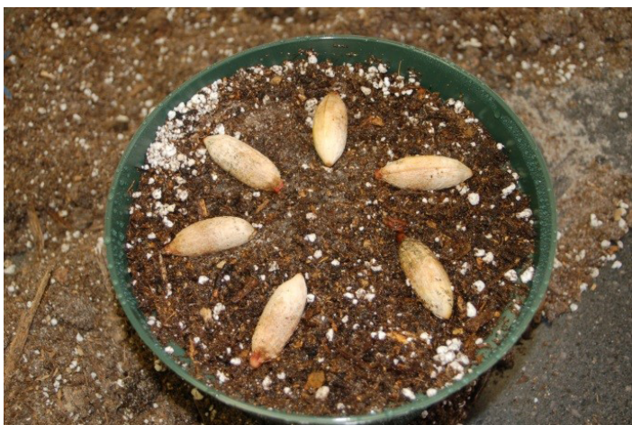
Figure 15. Place the seeds near the surface of the soil mix.