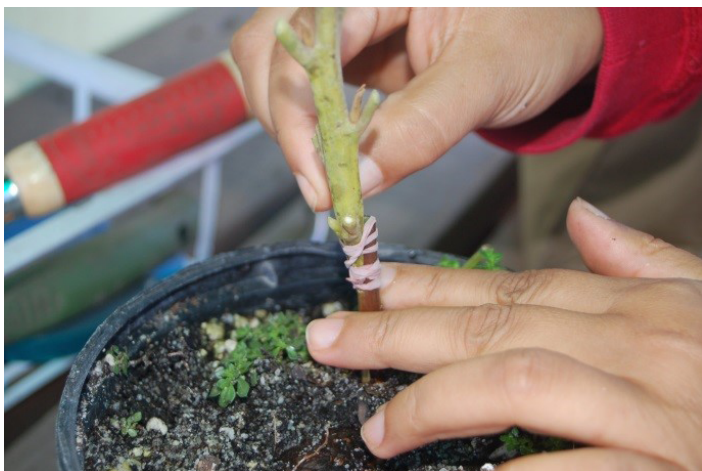
Figure 12. Wedge the scion into the rootstock and secure.