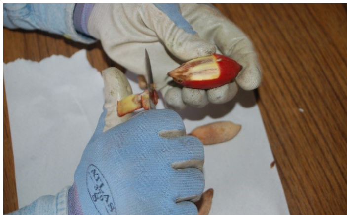
Figure 14. Carefully remove any flesh from the seeds.

When collecting fruit, look for mature fruit that are usually very colorful and somewhat soft to the touch. A fruit may go from green to light red to dark red or orange before it is fully mature and ready to be collected and sown. Dry seeds are usually dispersed by wind and sometimes need their seed coats to be worn away in order to germinate. When collecting dry seeds, look for seed pods to become brown, withered, and ready to open to release the seeds.