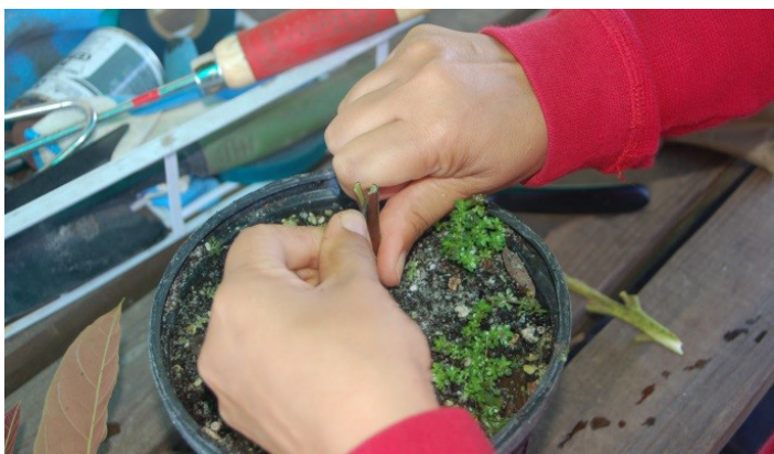
Figure 10. Remove the top of the rootstock and make a cut down the middle of the stem.