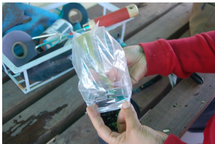
Figure 9. Bag or wrap the grafted union to keep moist.

It is important that the cuts made on both the scion and the rootstock are smooth, flat, and equal in width and length. The top of the rootstock should then be trimmed in order to stimulate bud growth in the scion. Once the cambiums have been joined, they will grow together and form a strong union of scion and rootstock that will become the newly propagated plant.