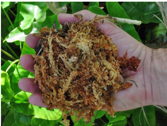
Figure 3. Use about a handful of sphagnum.

In order to facilitate root growth, place the moist sphagnum around the exposed area. Gently squeeze it to remove some of the water so it is moist but not wet. Place a generous amount of sphagnum and hold it tightly in place with the aluminum foil. Twist the foil closed at the top and bottom of the working area.