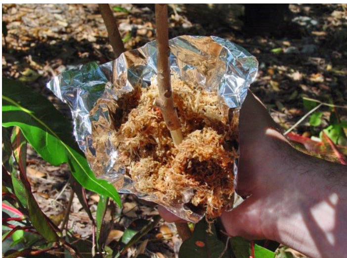
Figure 4. Secure the sphagnum with foil.

In order to facilitate root growth, place the moist sphagnum around the exposed area. Gently squeeze it to remove some of the water so it is moist but not wet. Place a generous amount of sphagnum and hold it tightly in place with the aluminum foil. Twist the foil closed at the top and bottom of the working area.