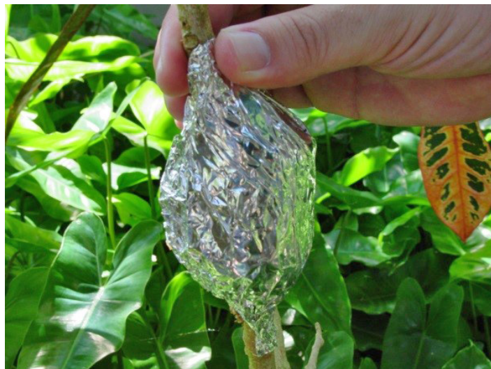
Figure 5. Make sure the foil is wrapped tight.

solution of 20-20-20 fertilizer. The air-layer should then be placed in a protected area. A mist bench is preferred but not as necessary as with cuttings. When the new container is filled with roots, the plant may be repotted or placed into the ground.