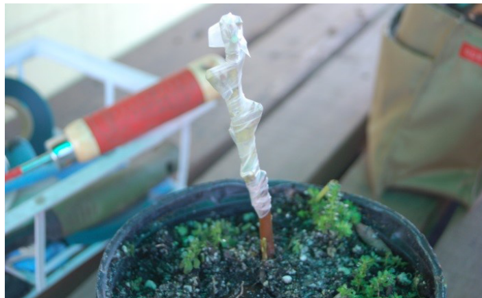
Figure 13. Bag or wrap the grafted union to keep moist.

once the tape is removed. Newly grafted plants are ready for planting when they have grown approximately 14 inches in length.