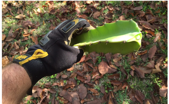
Figure 1. This pitaya cutting can be left to callus and then planted in well-draining soil mix.

Sexual propagation is a natural process resulting in a parent plant forming seeds that create offspring that are usually not genetically identical to the parent plant. This type of propagation is rarely done for fruit trees unless there are no known superior cultivars or you are growing rootstocks for grafting, or the seeds produce plants very similar to the parents. Growing a tropical fruit tree from seed will usually require many years before the tree is mature enough to produce fruit, with some exceptions like the papaya.