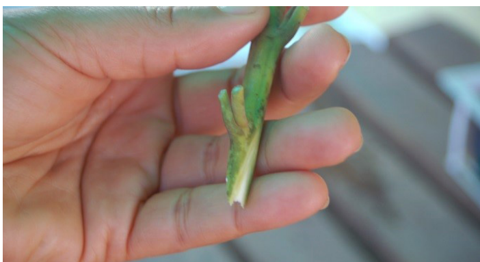
Figure 11. Cut the bottom of the scion in a wedge.