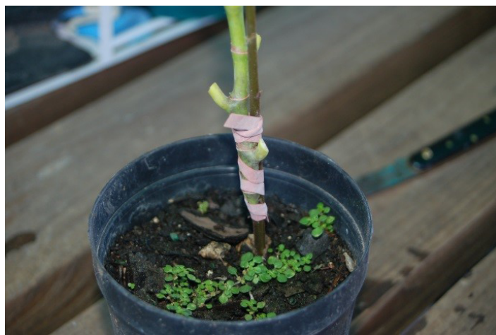
Figure 8. Line up and join the rootstock and scion.