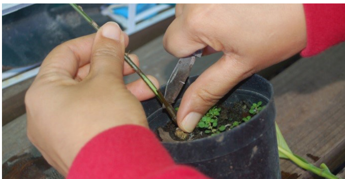
Figure 6. Remove the phloem on the rootstock.

Veneer grafting is done by removing the bark from one side of the scion. The bark is then removed from a portion of the rootstock that is roughly the same length as the scion. A flap of bark should be left on the bottom of the rootstock cut to help the scion hold in place. The bottom of the scion should be cut at a 45° angle to fit into the flap left on the rootstock. The exposed cambium (found just below the bark) of the scion and rootstock are then placed together and held in place with transparent grafting tape or a rubber band. The tape or band should be wrapped from bottom to top firmly, but not overly tightly. The tape will seal the graft to retain moisture as well as hold the scion in place. If you use a rubber band, you may need to seal in moisture with a plastic bag or parafilm.