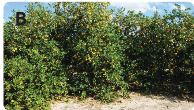
CLas-positive Valencia trees in central (A) and southwest (B) Florida (high psyllid pressure) under an intensive nutrition and irrigation program. These trees yielded more than 2.5 boxes per tree.