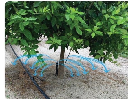
Fertilizer should be applied in the wetted zone of the soil where the irrigation water falls.