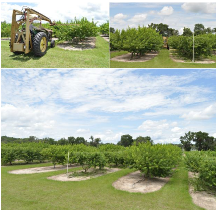
Figure 6. Top back the tree to a manageable height.