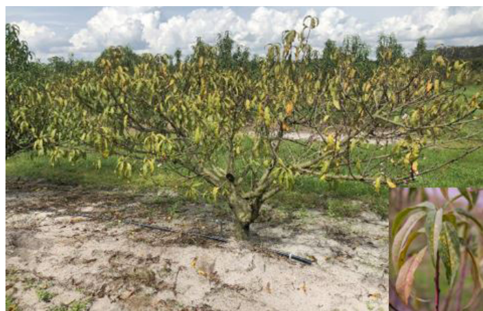
Figure 3. Peach tree 'UFSun' infected with peach rust.

Foliar diseases are more common during the summer when vegetative growth gets dense and causes increased humidity and decreased airflow. Peach rust ( Tranzschelia discolor ) is considered an important postharvest fungal foliar disease in the Florida climate, where summer rainfall provides favorable conditions for peach rust development (Figure 3). If not managed, this disease causes early defoliation with a significant negative impact on next season's flowers and fruit ( https://edis.ifas.ufl.edu/hs1263 ). All currently available peach cultivars in Florida are susceptible to the disease. Increased airflow associated with pruning will help reduce disease pressure. Altering the canopy structure this way can also improve the penetration of foliar sprays used to address disease or pest issues.