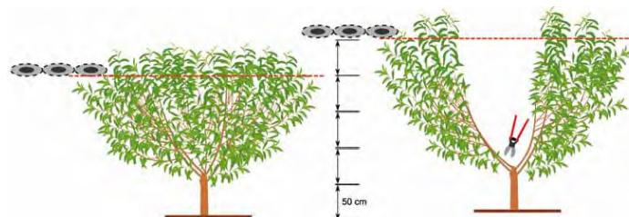
Figure 5. Open-center or vase training system during the second growing season. Left: The first mechanical hedging is applied at about 7 feet (200 cm) above the soil. Right: After mechanical pruning, hand pruning is used to thin the main branches down to four to five in number. It is highly recommended to leave some weak lateral growth in the inside the canopy to protect limbs from sunburn.