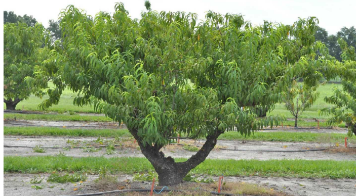
Figure 11. A finished example of summer-pruned peach tree 'Tropicbeauty' grown in Citra.