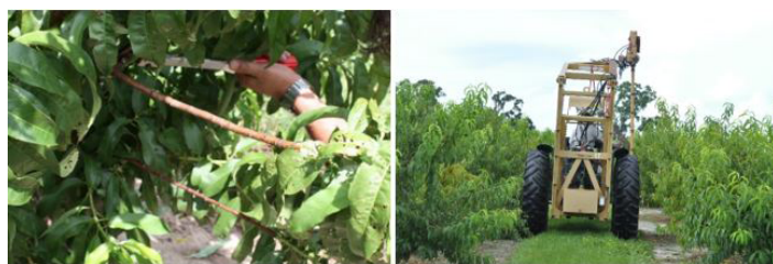
Figure 9. Prune back branches with excessive blind nodes to the growth point.

Step 5: To keep the height lower, head back the main terminal shoots on many branches to remove apical dominance, usually to a lateral (Figure 10). Reduce the lateral branches by \frac{1}{3} as well if they are long.