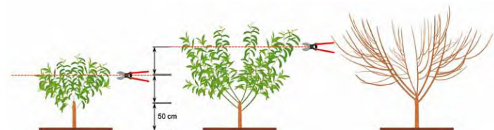
Figure 4. First manual topping is applied at about 40 inches (100 cm) above the soil. Center: Second manual topping is applied about 60 inches (150 cm) above the soil. Right: tree shape at the end of the first year.

Summer pruning is performed to favor branch induction of shoots through pinching or cutting the upper parts, sometimes multiple times in a year. The first manual (first-year) topping is implemented when the shoots exceed 40 inches (100 cm) from the soil. The second manual topping is done when the shoots exceed 60 inches (150 cm) from the soil (Figure 4). Mechanical topping is generally applied when the shoots exceed 7 feet (200 cm) from the soil, and manual pruning is done to thin the main branches down to four to five in number (Figure 5). However, it is highly recommended to leave some weak lateral growth in the inside of the canopy to protect limbs from sunburn.