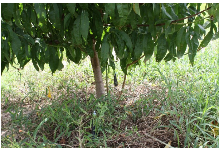
Figure 7. Remove all growth, including suckers, within two feet of the ground.

Step 3: Remove overly vigorous branches that are growing upright higher up where the main lateral branches split from the trunk in the center of the canopy. These branches are referred to as water shoots, which continue growing for much of the season when other lateral branches have slowed growth. Also, remove branches that are rubbing or crossing into the middle (Figure 8). Some smaller lateral branches should be left or cut in half to provide shade to the trunk to help prevent bark cracking by sunburn.