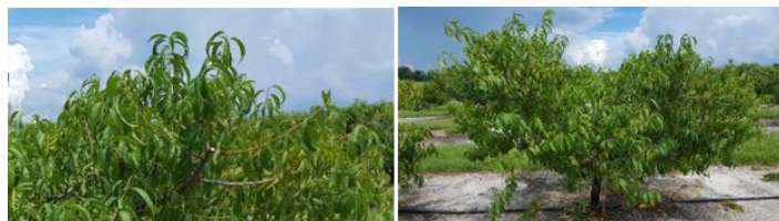
Figure 10. Manual lateral thinning.

Step 5: To keep the height lower, head back the main terminal shoots on many branches to remove apical dominance, usually to a lateral (Figure 10). Reduce the lateral branches by \frac{1}{3} as well if they are long.