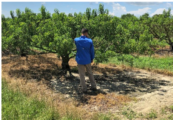
Figure 2. Ten-year-old peach tree 'UFSun' grown in Fort Pierce, Florida.

One of the goals of summer pruning is to bring the canopy size under control by encouraging a larger number of lateral branches growing along a greater span of the main scaffolds, effectively keeping the root-to-shoot balance intact on a smaller framework (Figure 2). This smaller framework favors efficient crop production because harvestable fruit is within arm's reach, thinning can be done from the ground, and spray treatments can have better coverage. Keeping the canopy size more compact will also reduce the need for ladders and allow harvesting from ground level, which improves picking efficiency. The amount of pruning required in winter is greatly reduced and pruning cuts in winter take longer to heal than cuts made on actively growing shoots in the summer. This lowers the overall incidence of disease infiltrating pruning cuts.