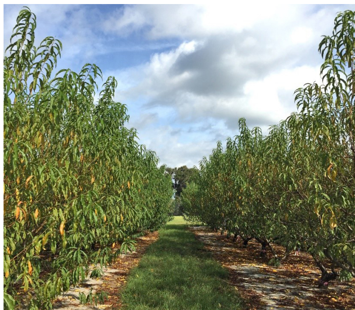
Figure 1. 'UFSun' peach cultivar growth after the harvesting period in June.

After the harvest season in any peach orchard, large or small, while daily picking may have ceased, the focus quickly shifts to how to manage the trees to support the subsequent year's crop. The strong apical dominance of peach trees will cause them to continuously put energy into upward growth, which ultimately shades out and hinders the development of fruiting wood in the lower portion of the canopy. Low-chill peach trees growing under Florida conditions can become vigorous and large. They have a short period of winter rest and a long growing season after the harvesting period, extending up to 200 days. Water sprouts also develop rapidly in the summer, causing denser vegetation and restricting airflow. Especially in subtropical peach-growing regions, summer pruning is a management strategy that can be applied to help restructure the canopy, direct the tree's resources into fruit production, and improve the efficiency of fieldwork. Without summer pruning, peach orchards in subtropical regions will continue to grow vigorously and, if left unmanaged, will reach a point at which ladders will be required to harvest and maintain the trees (Figure 1). Summer pruning can be a means of reducing overall tree size, redistributing fruiting wood for easier harvesting, reducing disease pressure, and increasing fruit quality.