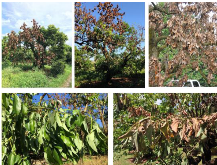
Figure 1. Laurel wilt symptoms in avocado trees include green leaf wilting, desiccated (brown) leaves, and stem and limb dieback.

chloride-based disinfectants (i.e., Green-Shield® or Kleen-Grow™) that are good disinfectants for cleaning tools. Do not mix quaternary ammonia products with bleach.