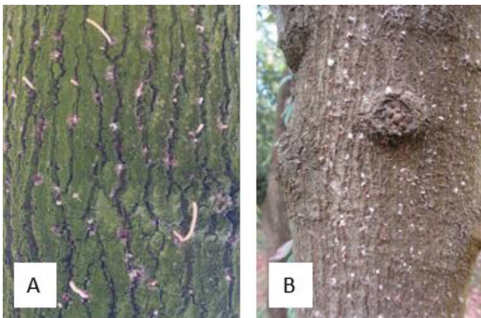
Figure 2. Signs of ambrosia beetle activity in avocado trees. Note the small circular sawdust mounds (A and B), sawdust tubes (A), straws and sawdust (B) from ambrosia beetle boring.