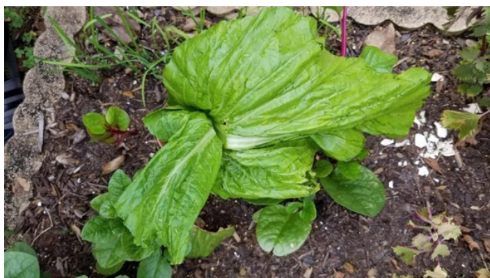
Figure 3. Chinese mustard ( Brassica juncea (L.) Czern) marketable leaves.