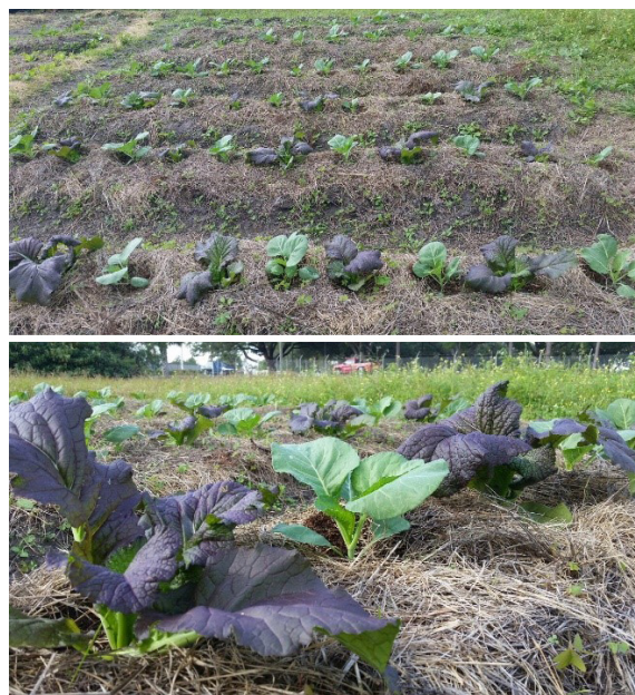
Figure 1. Chinese mustard 'Red Giant' (purple) ( Brassica juncea (L.) Czern) interplanted with collard greens (green) ( Brassica oleracea var. viridis L.).

an ovate shape with toothed margins, and the marketable size of a plant leaf is usually measured at least 6 inches in both length and width (CABI 2019, NCSU Extension 2020, Purdue 2020) (Figure 3). Each flower has typically four petals, creating a cruciform, or cross-like, shape (Castner 2004, NCSU Extension 2020). The petals are small, 0.25 to 0.5 inches in length and 0.2 to 0.3 inches in width, and usually have an ovate shape with a narrow basal claw and yellow color (CABI 2019, Castner 2004). Roots of Chinese mustard plant can reach 3 to 4 feet deep (Purdue 2020).