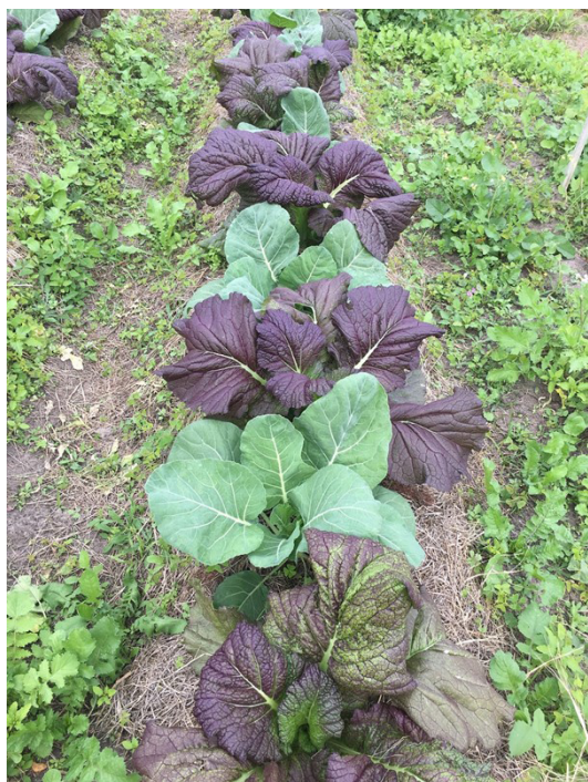
Figure 2. Chinese mustard ‘Red Giant’ (purple) ( Brassica juncea (L.) Czern) interplanted with collard greens (green) ( Brassica oleracea var. viridis L.).