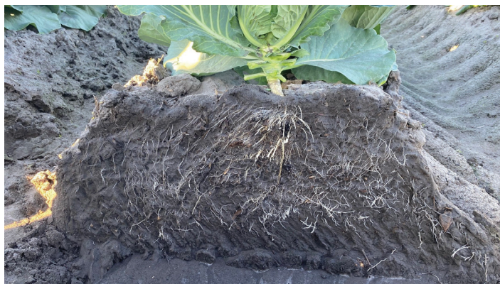
Figure 3. Root distribution of cabbage cultivated on bare ground (40-inch row spacing with in-row plant spacing of 8 inches, 19,600 plants/acre). Placement of fertilizer should target areas with high concentration of roots, avoiding broadcast application of fertilizer.

In-season adjustment of N-fertilizer can be made by evaluating the plant tissue N concentration (i.e., dry samples sent to the lab for total N content analysis; results are generally expressed as percentages). In this case, the most recently mature leaf can be sampled 8 weeks after planting. The adequate level of N% concentration is between 3%–6%; N% concentration below and above these values indicates high and deficient levels of N% concentration, respectively.