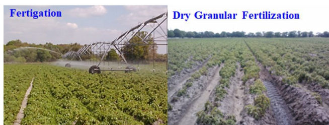
Figure 2. Growth difference in potato plants of 'Atlantic' with fertigation (left) and dry granular fertilization (right).