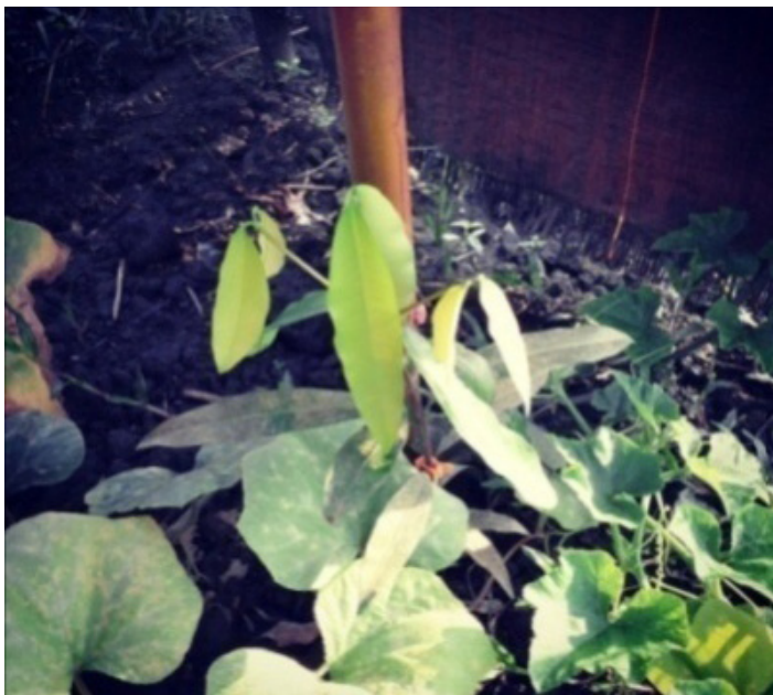
Figure 5. Achachairu plant intercropped with cucumber.

and productivity in Florida. Pruning can make harvesting simpler and easier. Achachairu fruit species can be pruned in the early growth stage. Pruning older trees should be primarily limited to the damaged branches or those close to soil (Duarte and Paul 2015).