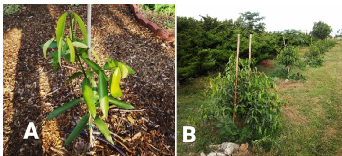
Figure 2. (A) Achachairu leaves. (B) Achachairu foliage.

Achachairu leaves are glossy, dark green, coriaceous (leathery in texture), and opposite (Figures 2 and 3) (Duarte 2011; Joyner 2000). Monoecious—i.e. having both male and female reproductive organs in the same flower (Duarte and Paul 2015)— Garcinia h. grows creamy white flowers (Marinho 2019).