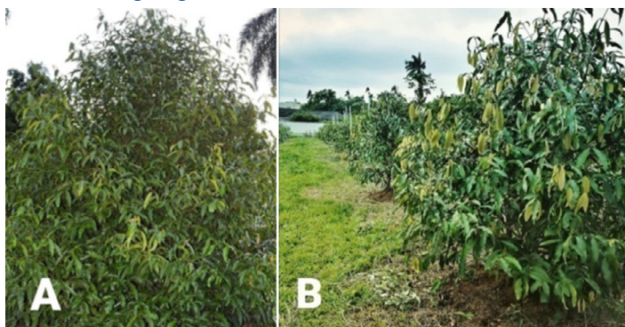
Figure 3. Achachairu trees at a height of approximately 20 feet.

The tree adapts well to warm climates (Winterstein 2016) and moderately acidic to moderately alkaline soils. Optimal pH levels in soil range from 4.7 to 6.6 (Joyner 2000); grown in central Florida, achachairu thrives in well-drained alluvial soil with sufficient moisture (Lim 2012). Garcinia h. can reach a height of 20 to 50 feet (Figure 3) (Duarte 2011; Joyner 2000). There is a 7-acre farm in south Florida that sells achachairu online at https://miamifruit.org/products/achacha-achachairu-box .