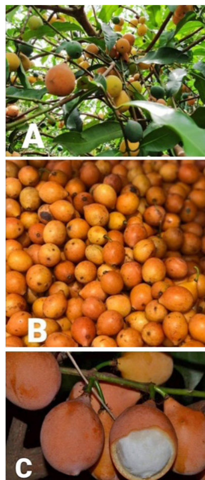
Figure 1. (A and B) Achachairu fruit. (C) The skin and pulp of Achachairu.

Achachairu is also known as achacha, Bolivian mangosteen or pacuri (Lim 2012) (USDA 2020), and kamuru and guanabacoa (Lim 2012). Planters harvest achachairu in winter and early spring ( https://www.trees.com/achacha-fruit-trees ); Floridian fruit markets make the teardrop-shaped fruit available from October through January, given natural growth conditions. The fruits of Garcinia h. range from 2.5 to 3 inches (Figure 1) and have orange skin (USDA 1990) and white, sweet pulp (Barboza da Silva et al. 2018).